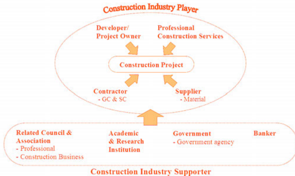
Figure 1: Construction Industry Stakeholders

2016). The authors, finally, developed their own structure of construction industry stakeholders as shown in Figure 1.