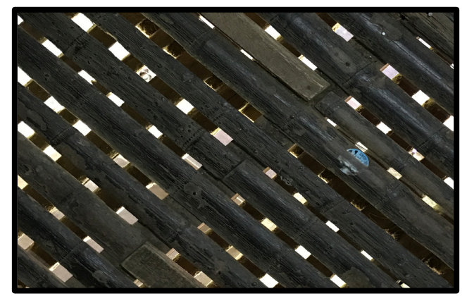
Figure 3: Nibong Flooring arranged in crisscross pattern

According to Christopher (2017), the floor of the tall longhouse is built using nibong tree trunks. However, only the serambi (foyer) flooring was assembled using belian tree trunks. According to the Melanau traditional beliefs, belian tree trunks wood is used specifically for the foyer area as it was believed to bring in prosperity to every household. The flooring of other areas on the main level of the tall longhouse is built using nibong tree trunks that are arranged in a crisscross pattern (Figure 3) with tiny gaps in between. The trunks were arranged in such ways to act as security, making sharp weapons such as arrows to hardly pass through. When the Melanau was attacked from below, the household will pour hot boiling water onto the floor. The enemy below will get skin injuries due to the hot boiling water.