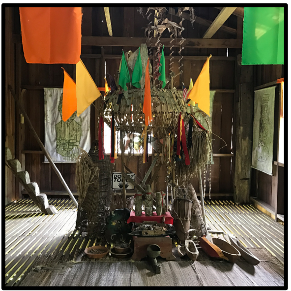
Figure 4: Appliances for Bebayoh ritual

Located in the foyer is a section for bebayoh . Bebayoh is a ritual when the shaman acts as an intermediary with the supernatural, ipok , a reflection of the spirit, to cure diseases or to send off