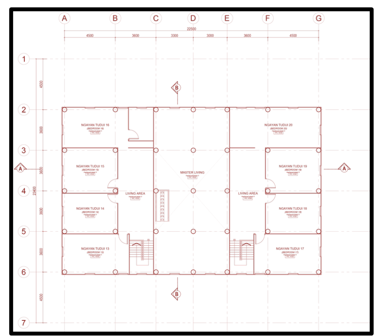
Figure 6: The Melanau Tall Longhouse, Upper Level Floor Plan.

Melanau ethnic group has an interesting history although it is hard to discover their true origin. Nowadays, similar to another ethnic in Sarawak, the Melanau community experience changes in the daily life. Modernization has led to the change of ways of living, and they now live in individual houses instead of the traditional tall longhouses. Further, more methodological work is highly needed on how to capture the information about the Melanau culture and tradition that bring an impact towards their traditional architecture.