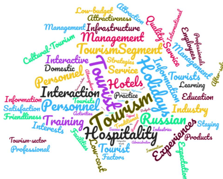
Figure 1: Tourism word clouds.

Tourism development in Russia is far behind the real possibilities of the country tourism potential. According to the results of the survey, the prestige of domestic tourist trips is significantly lower than their foreign counterparts, especially among highly profitable social groups. Among the respondents whose income exceeds $250 per family member per month, the share of people who prefer overseas vacations is much higher (39%, which is 13 percentage points higher than average). Similarly, the respondents with a higher level of education (higher, incomplete higher) chose the option of foreign vacations more often (37%, which is 11 percentage points higher than the average). As for trips with the purpose of cultural and educational tourism in the Russian Federation, the demand here is much lower than that of the options for "beach holidays". Thus, in modern conditions, there is a certain contradiction between the high tourism potential of the Russian territories and the lack of Russian tourist offer demand among the population, the low level of competitiveness and prestige of tourism products, primarily among social groups with a high level of income and education. Figure 1 shows tourism word clouds.