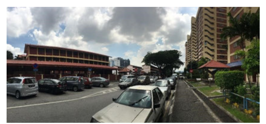
Figure 15: View between educational and residential district.