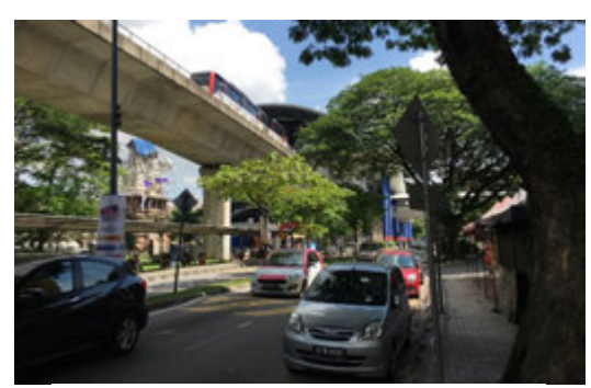
Figure 23: (1) LRT Sentul East.