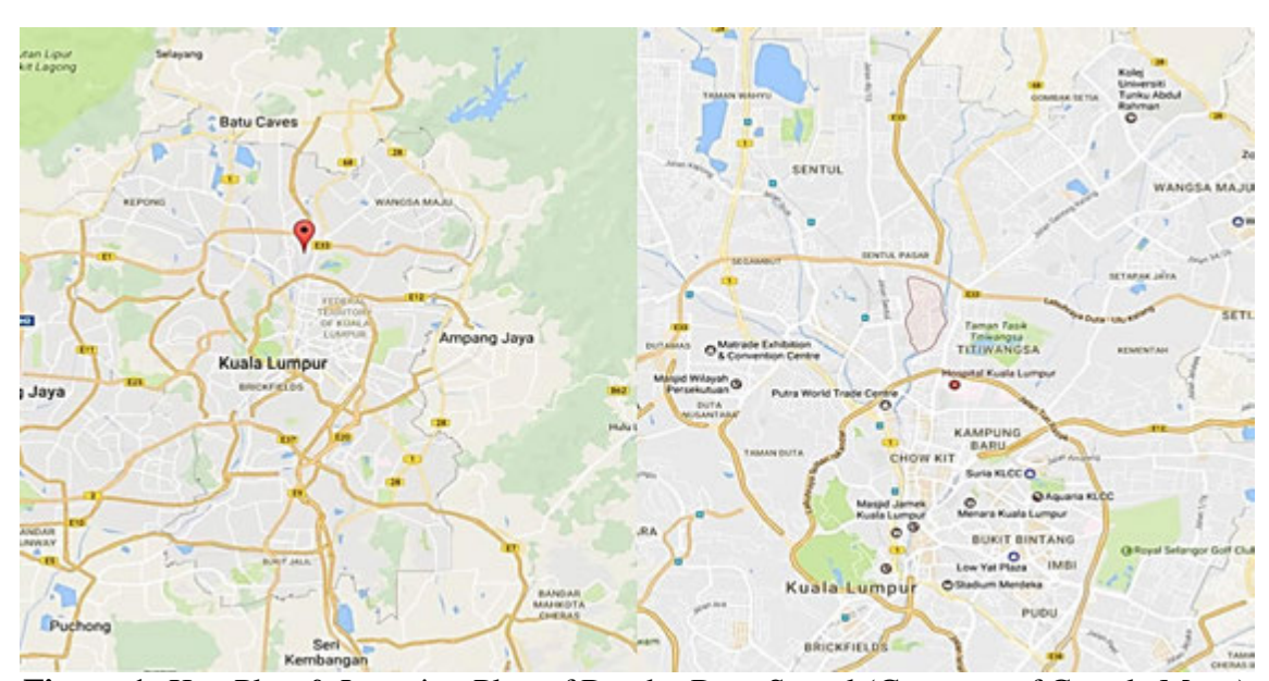
Figure 1: Key Plan & Location Plan of Bandar Baru Sentul

The study comprises of the whole township of Bandar Baru Sentul (Figure 2). Bandar Baru Sentul is a major township in Sentul, Kuala Lumpur, Malaysia. Sentul is a satellite city for the city center of Kuala Lumpur, located only 3km north from the heart of the city (Figure 1). The site was chosen because: (1) it can be used to represent the effect of the rapid development of Kuala Lumpur had on its neighborhood's planning, and (2) it is easily accessible for conducting this study.