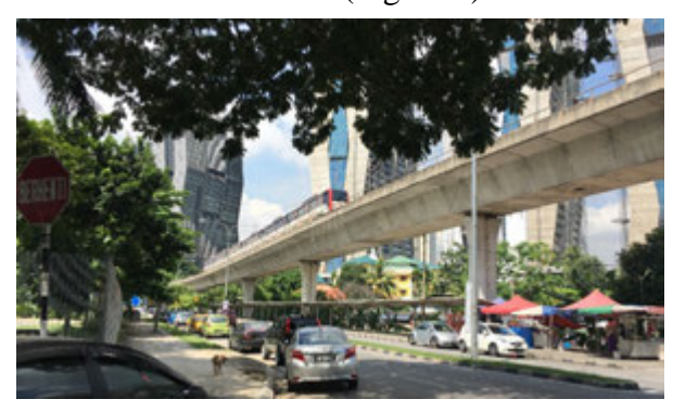
Figure 8: LRT Railway at the west side of Bandar Baru Sentul.

In terms of transport, there are a lot of categories. Most of the people in the site at the time of visit are using their own private vehicle like cars and motorcycle. For public transportation, there are ranges of options available such as taxis, RapidKL's buses, LRT trains, and even free school buses for the township's residence that can be considered a very commendable effort to ease the heavy traffic that occurs almost all time at the site (Figure 7).