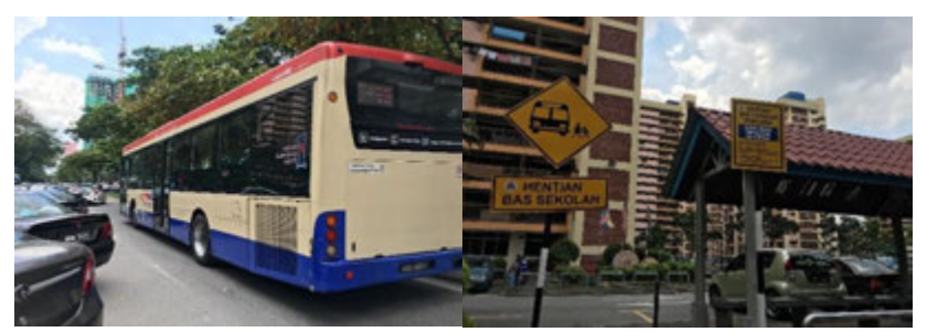
Figure 7: RapidKL bus service available in the site (left), and free school buses (right).

In terms of transport, there are a lot of categories. Most of the people in the site at the time of visit are using their own private vehicle like cars and motorcycle. For public transportation, there are ranges of options available such as taxis, RapidKL's buses, LRT trains, and even free school buses for the township's residence that can be considered a very commendable effort to ease the heavy traffic that occurs almost all time at the site (Figure 7).