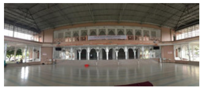
Figure 20: Masjid Amru Ibn Al-'As' gathering area.

The last type of node is the religious node. It is notable that the mosque in the area, which is Masjid Amru Ibn Al-'As has its own gathering area (Figure 20) and kitchen. There are also a lot of banner promoting programs that will be held at the mosque around the compound, example given, the banner in Figure 20. During the visit to the mosque, there are quite a number of people present even though it is not prayer time. This shows that the mosque is also one of the nodes of Bandar Baru Sentul.