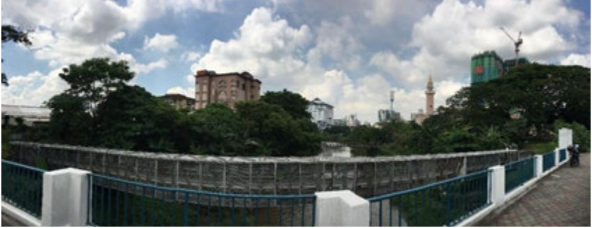
Figure 11: Gombak River at the east side of Bandar Baru Sentul.