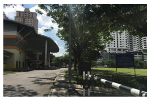
Figure 16: Pusat Komuniti Sentul Perdana and the field in front of it.