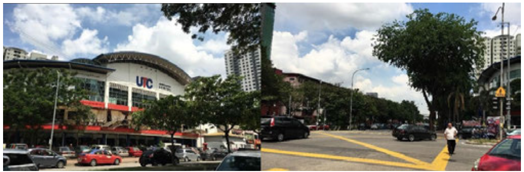
Figure 21: UTC Sentul building (left), site's main intersection (right).

The last type of node is the religious node. It is notable that the mosque in the area, which is Masjid Amru Ibn Al-'As has its own gathering area (Figure 20) and kitchen. There are also a lot of banner promoting programs that will be held at the mosque around the compound, example given, the banner in Figure 20. During the visit to the mosque, there are quite a number of people present even though it is not prayer time. This shows that the mosque is also one of the nodes of Bandar Baru Sentul.