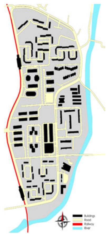
Figure 2: Layout Plan of Bandar Baru Sentul

elements. The site layout plan of Bandar Baru Sentul was drawn using AutoCAD initially to have an initial understanding of the site. After the site plan was drawn, an on-field study was conducted via a site visit to the site to have a better understanding of the site as well as to match the data obtained the site layout plan that was done earlier. The urban design elements identified then expressed using the combination of AutoCAD drawing and edited in Adobe Photoshop.