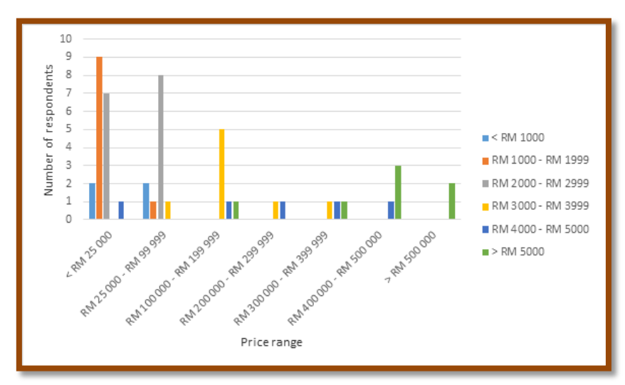
Figure 2: Pricing range that is considered affordable according to income levels

considered affordable to them. Of these figures, a majority of 8 respondents are from the income level of RM 2,000 to RM 2,999. Another 2 respondents are from the income level less than RM 1,000. There is 1 respondent each from the income level of RM 1,000 to RM 1,999 and the income level of RM 3,000 to RM 3,999.