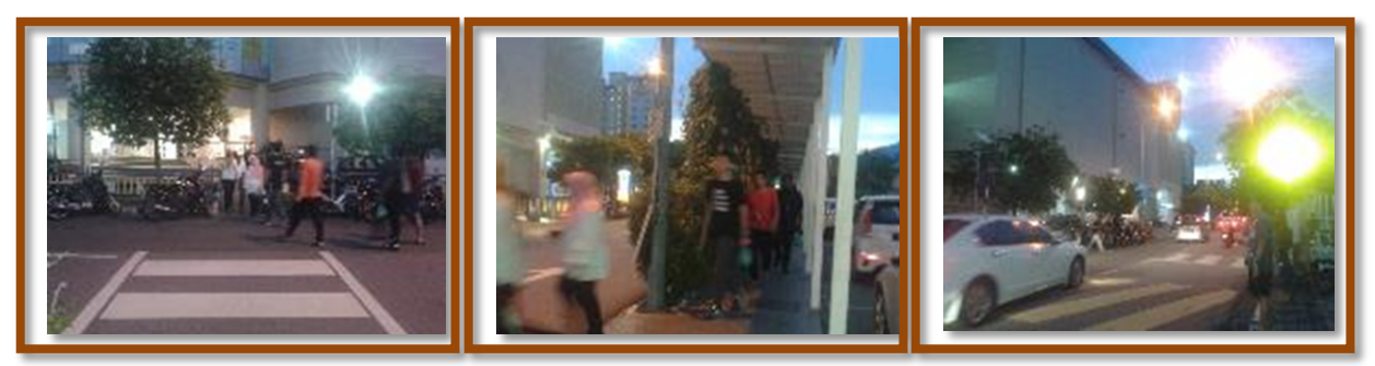
Figure 12: Zebra crossing at the collector road

It is indeed plausible that streets with more pedestrian-oriented activities (shops, restaurants, services, etc.) would be more memorable, and streets that have more people on them would be better remembered (M. Mohsenin, A. Sevtsuk, 2013). These shows, pedestrian activity inside the city helps the residents and user to memorized the place.