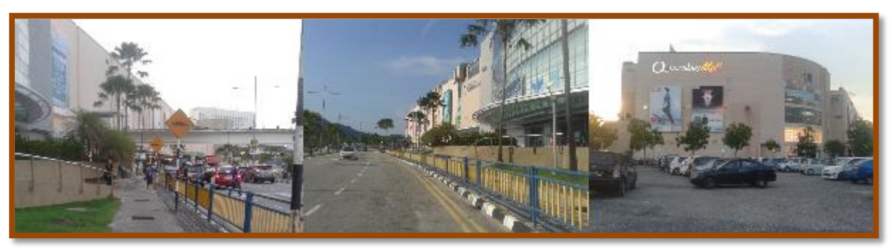
Figure 1: Queensbay Mall, Bayan Lepas, Penang

Queensbay (Figuare 1) is a new upmarket waterfront development. It is located in the southeastern seaboard of the island. The development consists of shop offices, corporate towers, hotel, bungalows, semi-ds, seafront villas, condominium, service apartment, and Queensbay Mall, the largest and longest shopping mall in Penang. 80 % of the land area has been designated for commercial use while the remaining 20% is residential (Adam Tan,2007).