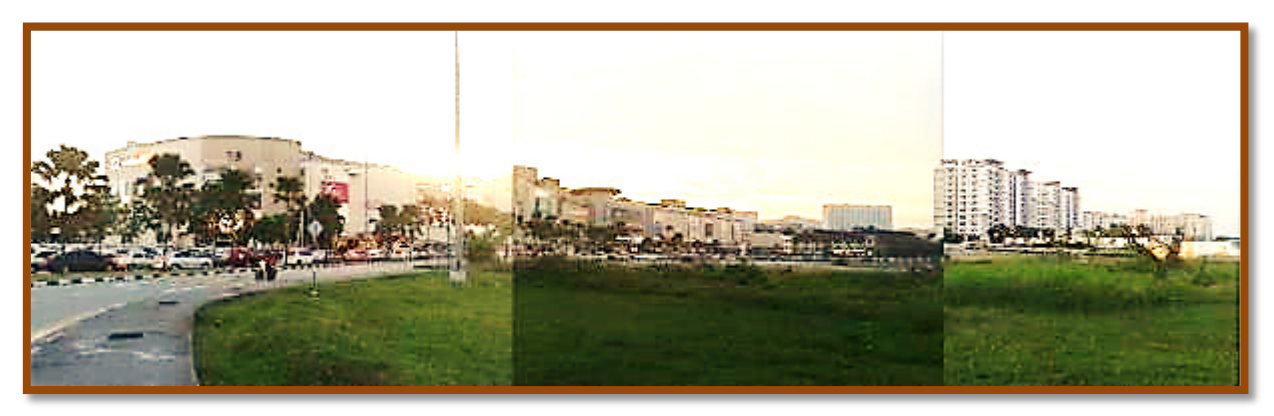
Figure 2: Queensbay districts from internal view shows a Queensbay Mall on the left, 3 storeys shop lot in the middle and high-rise apartment facing water front

scene in Penang. The construction of the mall, formerly known as the Bayan World Megamall, stopped in 1998 because of the Asian financial crisis. The project was abandoned for eight years, before fully completed by the end of 2006. The opening of the Mall is the beginning of the growth in this new city (Figure 2).