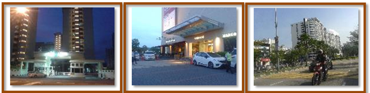
Figure 13: Putra Palace, South Entrance and Beer Factory.

Good physical characteristics of districts are determined by continuities and homogeneities of facades materials, textures, spaces, forms, details, symbols, building type, uses, Activities, inhabitants, colors, skyline topography, ...etc.(Lynch,1960). By looking to the composition of the buildings and land plot placement, Queensbay can be consider as a good layout for district combination between commercial and residential. Bay Garden was built to respect the similarity of the three stores shop lot besides. However, the idea of gated and guarded applied create a social boundary to the neighboring residence. It has been debate and discuss in several researchers regarding gated and guarded scheme and policy especially regarding strata title. Another disadvantage, there are possibility to of developer to exploit the prices due to the security purposed.