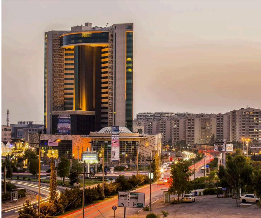
Figure 3: Commercial buildings in Erbil City.