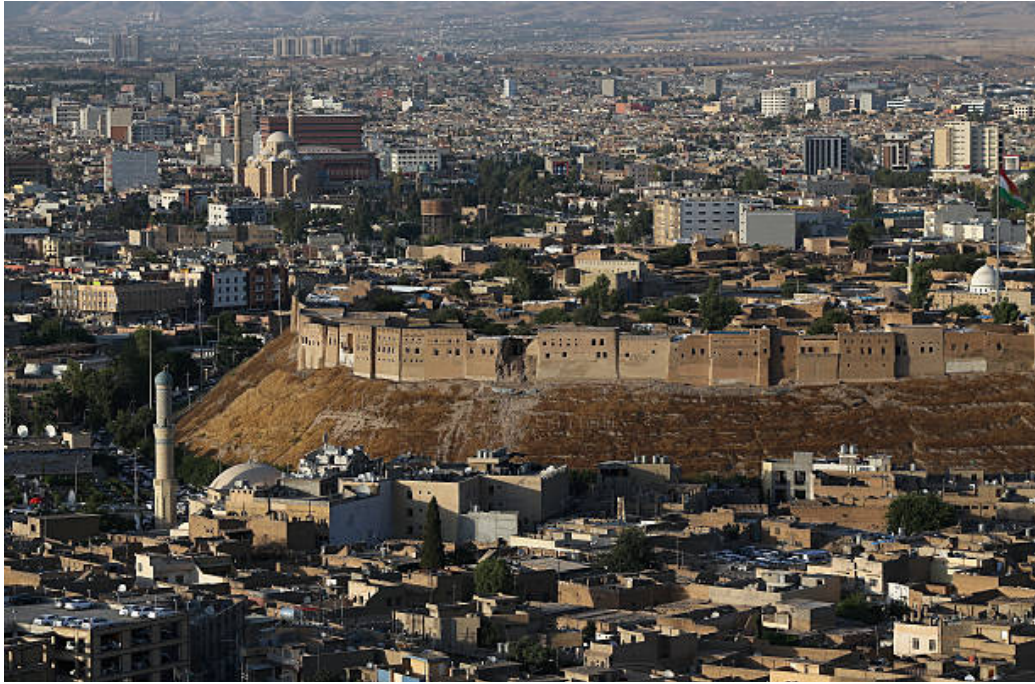
Figure 2: Erbil city heritage citadel (Courtesy of Getty Images, 2014).