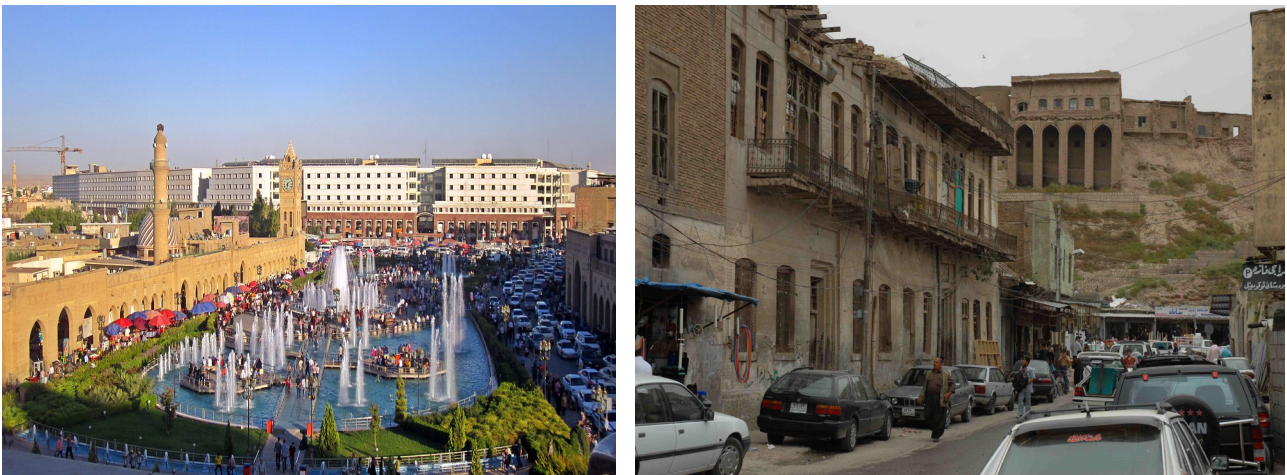
Figure 1: (Left) Modern construction; (Right) Heritage values.

In Erbil City, as a result of the free economy, rapid changes in commercial street buildings become a visible phenomenon which merges between the desire toward traditions (the spirit of heritage) and the aspiration of new technology. This has led to a state of chaos of architectural appearance of commercial buildings and created various challenges in the architectural expression. It is interesting to note that in last decades, architecture in Erbil city (See Figure 1), passed through rapid transformations due to the conflict tension between the desire towards globalization and conserving approaches of the historical heritages (Baper 2011). In this regards, Salama (2014) stated that a productive land opportunities and an operating environment will liberate for new challenges in architectural forms due to plurality of schools of thoughts.