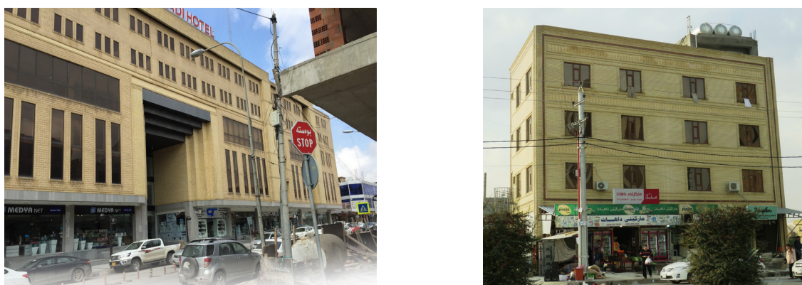
Figure 7: (Left) Sultan M. Street; (Right) Rasti district

The results specify that connectivity with heritage buildings (heritage building with historical values) in 26 cases. These cases were connected with heritage building through following values: using similar facade elements, facade elements relationships, unity and human scale, Juxtaposition of building masses, similarity of building heights(skylight), continuity of roof shapes, using similar facade materials, using vernacular architectural details. Figure 7, the study find out that the most popular value for this parameter is using similar facade elements due to special regulation of buffer zone regulations from Erbil city municipality.