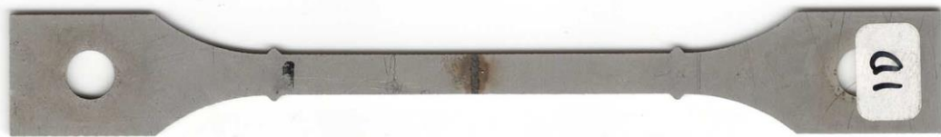
Figure 3: Tensile test sample