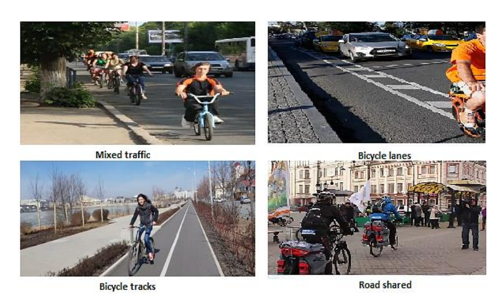
Figure 2: Types of bicycle roads/tracks between Kazan Federal University and the university village