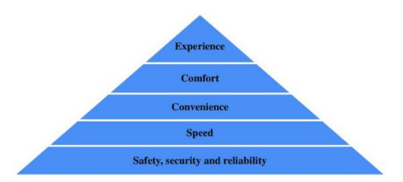
Figure 1: Maslow Transportation Level of Service in public transport (after [6]).

We tried to cover the basic needs as the prevention of road accidents and also offer a secure bike parking (Figure 1). These factors would give us convenience and comfort when we use the alternative bicycle road [6,7].