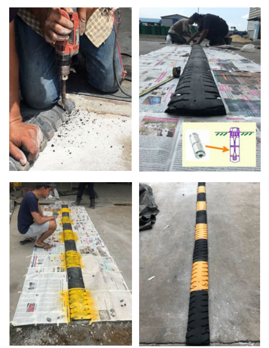
Figure 2: Installation process of bumps built with used pneumatic rubber tires on a local road