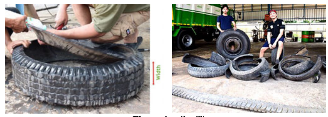
Figure 1: Cut Tires