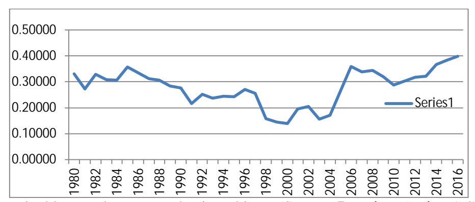
Figure 1: Sustainable Development Index in Pakistan