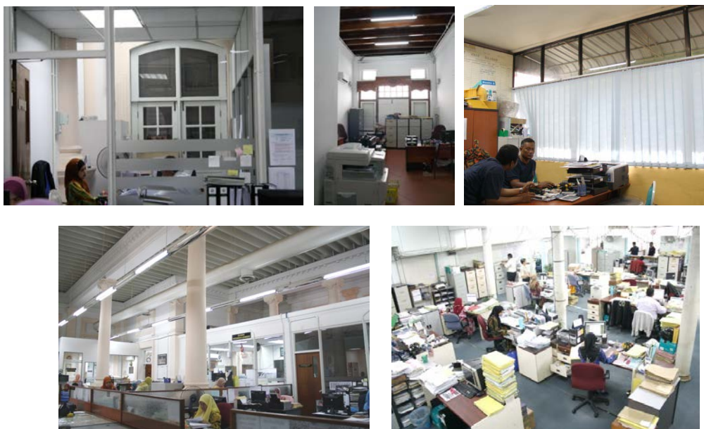
Figure 3: The Condition of the Working Spaces in the Studied Buildings.

According to D. Kincaid (2002), there are four characteristics of physical changes in building adaptation: low, low-medium, medium-high, and high change. In this research, Buildings A and C are considered as the low-change. The external buildings were maintained according to the original design but minor modification on the interior. Building B, D, and E is categorised as the medium-high change. The external building fabrics were maintained, but the building structure was modified and reorganised the interior space. The medium-high change category is similar to the criteria for the Category 2 heritage building according to the Malaysia National Heritage Act (Act 645).