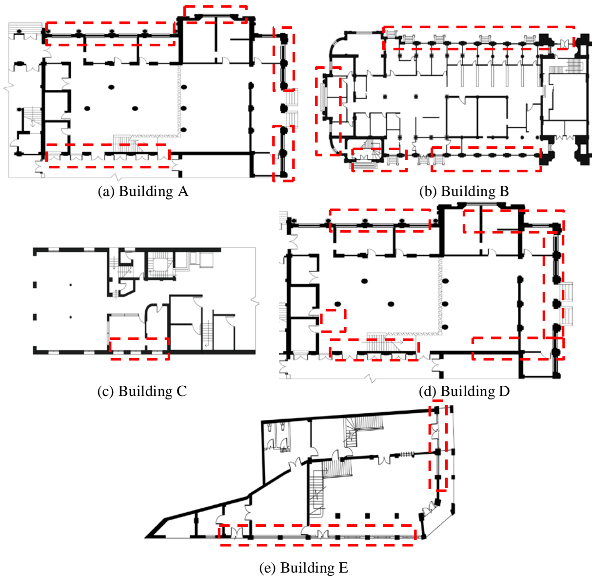
Figure 2: The layout of the Studied Buildings (not to scale)

office. To capture the whole condition, the measurement was taken in every 1.2 m 2 grid of the studied space and in desk height. The sampling points are illustrated in red dots (Figure 1 a-e). The Mean light level was obtained by adding the number from each grid.