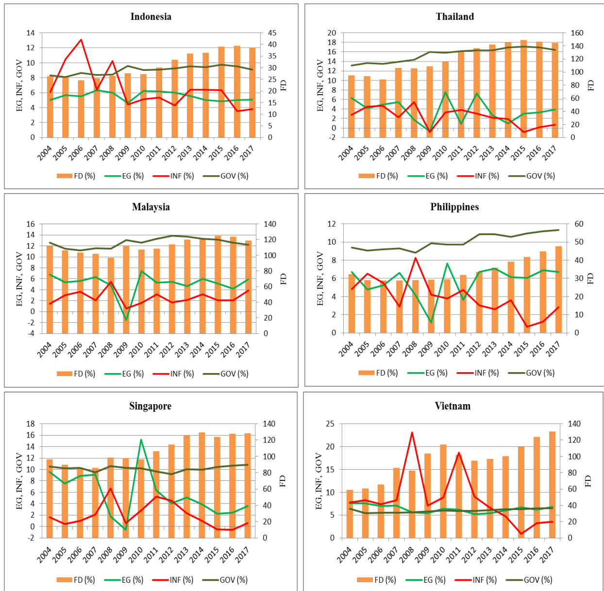
Figure 2: Financial development in ASEAN countries.