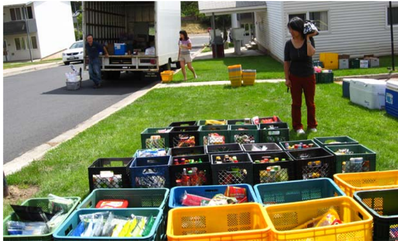
Figure 2: An open market close to the student housing of Washington State University campus.

Both Washington State University and the University of Idaho campuses have been used for occasional outdoor markets by local communities. Figure 2 displays an open market in operation close to the student housing of Washington State University campus.