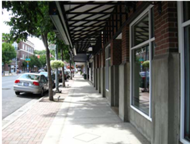
Figure 6: Street frontages in Pullman's Main Street lack of personalization and permeability.