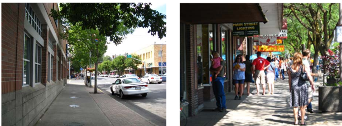
Figure 3: The Different Street Life in downtown Pullman (left) and Moscow (right) at a typical weekend.

However, both towns demonstrate a significant difference in urban identity and the quality of public spaces perceived by residents. 83% of respondents report that they consider Moscow is a better place to live with better urban sense and features than Pullman. 72% of respondents consider Moscow is more pedestrian-friendly and 65% report more urban amenities located in Moscow. In fact, 61% of respondents who live at Pullman often go to Moscow for leisure and shopping while only 35% of Moscow residents frequently travel to Pullman for leisure and shopping (one major reason is that there is no tax for grocery shopping in Washington). Figures 3 and 6 demonstrate the huge difference of weekend street scenes at the Main Street of Pullman and Moscow. The two photos are taken on the same day and same time. Obviously, there are many more people showed in Moscow's Main Street where public spaces are more used and better appreciated. Therefore, although as college towns, Pullman and Moscow are alike in many aspects, their public spaces show different patterns of performance.