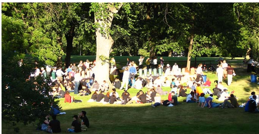
Figure 1: Event gatherings on the University of Idaho campus.

Campus landscape and university gardens are also central to the local residents’ public use. In this country, the belief that a college campus should be green and wooded has historically influenced most American university planning (Gumpercht, 2003). A park-like campus landscape fosters a natural consolation and also instills an appreciation for natural beauty and refinement to students and faculty. Gumpercht (2007) describes this trend in campus planning by citing Turner’s statement “the romantic notion of a college in nature, removed from the corrupting force of the city, became an American ideal.” (p.96). Both the University of Idaho and Washington State University have spent over 1 million dollars on their campus landscape maintenance and improvement. Both campuses are open to all public 24/7. Many local residents like to go to campus for walking the dog, jogging, or taking a rest. 54% of respondents occasionally go to university campuses for leisure activities. Consequently, it is more likely to see non-university residents in college towns be present on campus for a variety of purposes and there are more opportunities for social interactions for non-academic activities on the university campus which is located in a college town. Local communities often conduct event gatherings on the University of Idaho campus, see Figure 1.