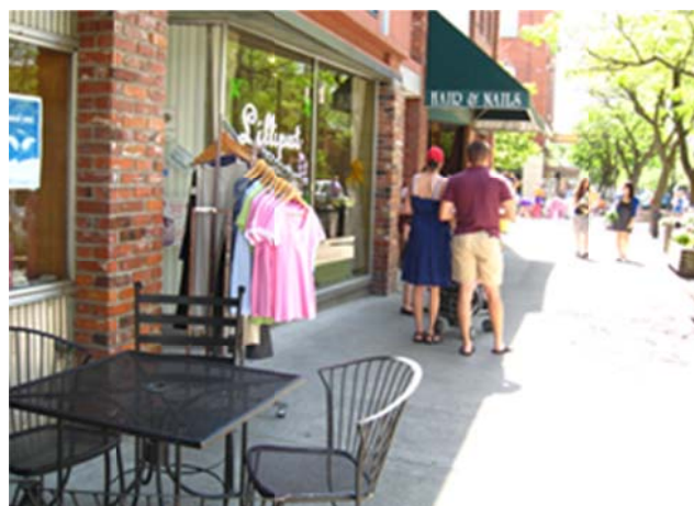
Figure 5: Business owners in Moscow Main Street use outdoor seats, displays, and signs to personalize the interface with streets.