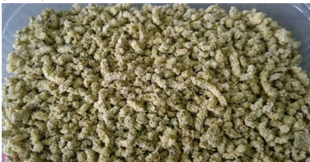
Figure 3: Multicomponent feed supplement.

The developed non-waste technology, with the specified values of the modes and parameters, allows obtaining granules with a diameter of 2-3 mm and a length of 2-3 cm (see Figure 3). The strength of the granules was 93-95% and moisture content 92%.