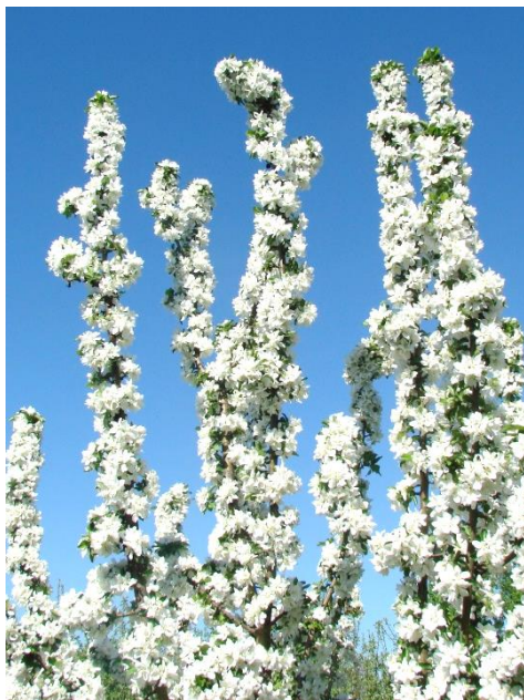
Figure 1: Selected form 7-I-13.

Taking into account the ability to restore water lost after heat shock, most of the studied genotypes were included in the group with 100% recovery ability. Altayskoye bagryanoye, Jay Darling, M. purpurea pendula , M. prunifolia 2454, M. zumi , M. cerasifera forms had slightly lower value of this parameter (80.0-92.5%). Charah, Surpriz Altaya, Antonovka (control) varieties, M. virginiana , M. baccata , M. floribunda , M. sylvestris 41639, M. niedzwetzkyana 13279, M. sargentii , M. sachalinensis 25950 species, and selected form 7-I-36 were less able to restore leaf turgor.