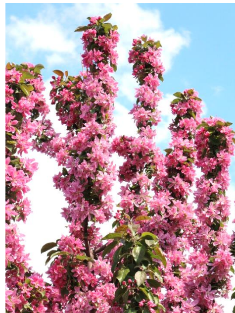
Figure 2: Selected form 7-I-14.

The information on water regime parameters was obtained for each studied from water holding capacity of leaves during drought simulation, degree of water content recovery during drought simulation, water holding capacity of leaves during heat shock simulation, degree of water content recovery after heat shock. Differentiation of original varieties taking into account all studied parameters is difficult since the distribution according to the degree of stability was different in each variation series. According to previously obtained data, the values of these parameters correlate with the overall drought tolerance of genotypes (Yushkov, 2019). In this regard, a ranking technique was used for summarizing all parameters – serial number of the object being in each ordered series. The first rank in each variation series was assigned to an object with a preferred degree of quality, i.e. the minimal percentage of water loss, the maximal water content in tissues, and degree of water content