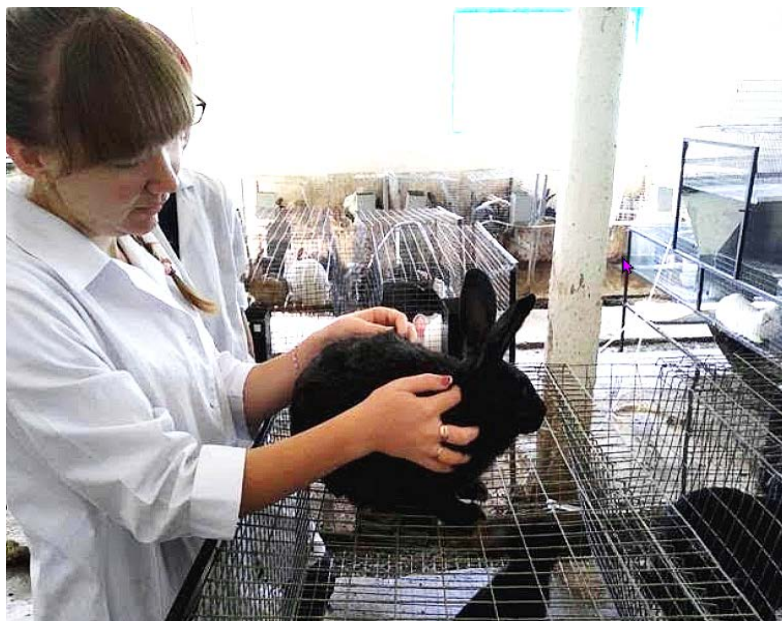
Figure 1: Exterior assessment of rabbits.

Hair is dense, thick, pure white, with a thin fur lining, the skin is thin, dense (Figure 1).