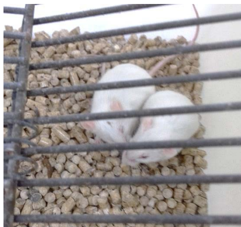
Figure 2. Allocation in pairs.

To identify the effect of fasting days on the reproductive function of white mice, based on analogues, three groups of 10 individuals were formed. Of the males and females, they were not related pairs and were transplanted into separate cells (Figure 2). Mice were fed daily with a mixed-type diet. Drinking water was not limited. The first group was used for control. In the second group, one fasting day per week was arranged for mice, and in the third group, two fasting days per week. On fasting days, the animals did not receive food at all, and the water remained plenty.