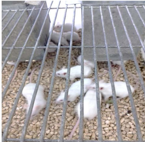
Figure 1: Animals in quarantine.

The experiment was conducted in the vivarium of the Vyatka State Agricultural Academy and lasted about three years. The test was carried out on clinically healthy white mice, the same age of 45-50 days, which had not previously been tested. The average mass of males was 20.7 \pm 0.58 grams; the average weight of the females is 18.0 \pm 0.65 grams. Before the experiment, the animals were quarantined for 10 days (Figure 1).