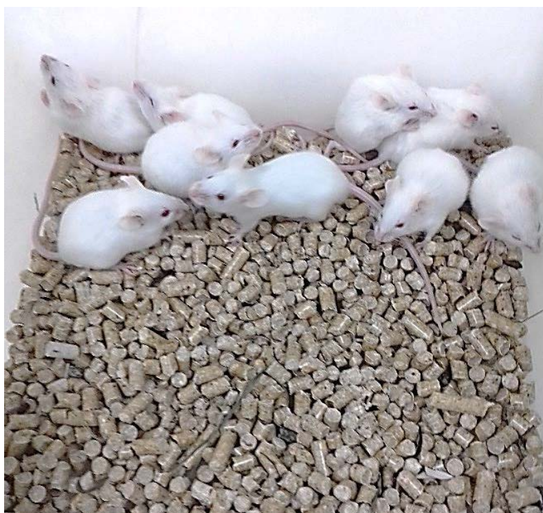
Figure 3. Grown young animals.

Reproduction of mice in all groups began at one time, one and a half months after the formation of pairs. In the first reproductive cycle in the control group, litter was obtained in only one pair of five. In the first experimental group with one fasting day, the offspring appeared in all couples, and in the group with two fasting days in the first breeding cycle, 75% of the females were born. The number of newborn babies in one litter varied from 5-11 mice per female (Figure 3).