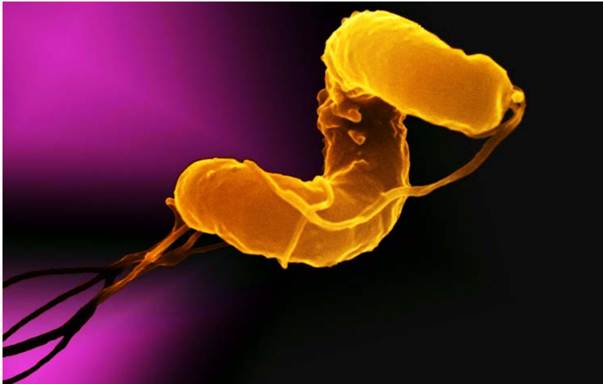
Figure 1: Leptospirosis or infectious jaundice: a natural focal disease.

For the period from 2016-2018, according to the Rospotrebnadzor and the Inforeaction of the microagglutination-analytical center of the Veterinary Control Department of the Federal Center for Animal Health, 469 people became ill with leptospirosis, and 470 dysfunctional cases were registered, in which 5,653 were detecting sick productive animals.