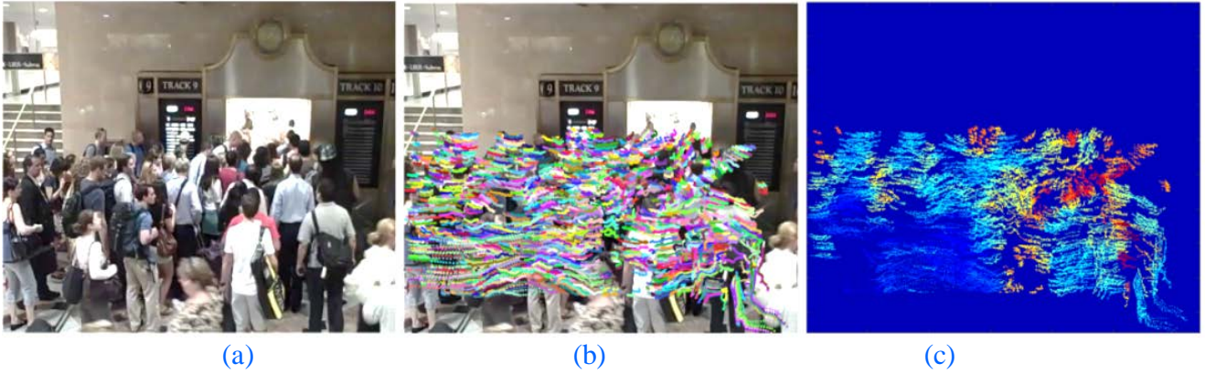
Figure 1: (a) the sample frame, (b) the trajectories extracted overlaid over the image and (c) the density map.