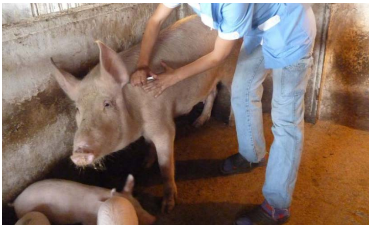
Figure 1: Pigs' injection

The pigs of both experimental groups were injected once, in the upper third of the neck (behind the ear), with a tissue drug at the rate of 1 ml/100 kg of body weight (figure 1). Before use, the drug was diluted with 0.5% Novocain solution in the ratio of 1:1.