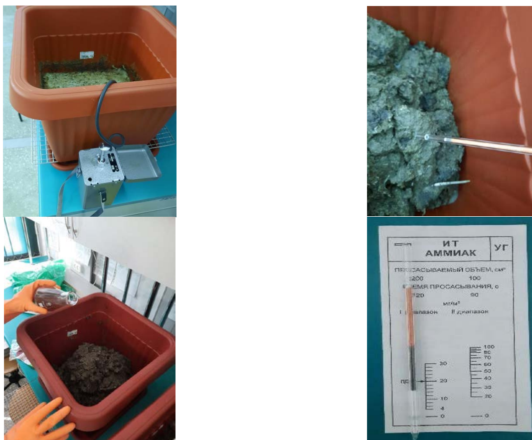
Figure 1: Introduction of microbial culture of the genus Azotobacter into chicken manure and analysis of ammonia nitrogen using a gas analyzer UG-2

At the next stage of research, it screened bacteria of the genus Azotobacter of collection and natural strains. There was analysis of the content of ammonia nitrogen in the environment over experimental batches of chicken manure treated with experimental cultures (Figure 1).