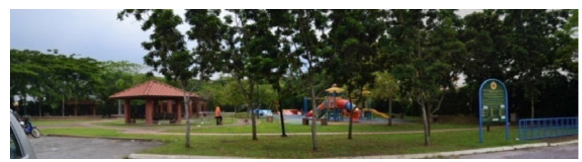
Figure 2: Recreational area attached with exercise equipment and playground which suitable for all types of users such as children, adults and elderly at Taman Kepong