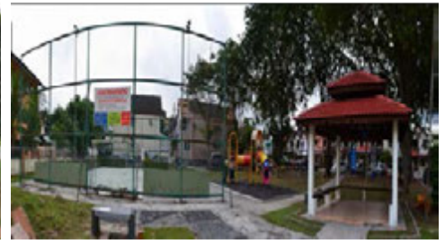
Figure 1: Basketball court, playground and mounding area that provide at Taman Wangsa Melawati can give a sense enjoyment and excitement to the teenagers and children users. Recreational area provides a lot of facilities, such as playgrounds, gazebos, benches, reflexology pathways and Futsal courts for residential users Taman TDDI