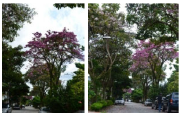
Figure 4: The flower Tabebuia rosea in certain periods such as in December to March creates beautiful scenery and aesthetic value for areas of producing colorful bloom flowers

Apart from that, the specific characteristic that can influence the value of the house also identify through the availability of street planting, streetscape elements and pedestrian walkway. Visualization analyses indicate that the street planting can create aesthetic value and identity in the residential areas. The use of Tabebuia rosea (Tecoma) and Lagerstroemia speciosa (Pride of India) can create harmonious scenery (Figure 4).