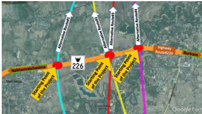
Figure 4: Starting points of all alternatives, from Highway route #226.

14+000 and 17+000. The highway Route#226 currently has four traffic lanes with a traffic median raised island. Area landscape and geography is surrounded by agricultural fields.