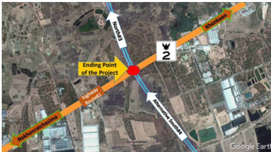
Figure 5: Ending point of the project

The Ending Point of the Project meet the highway Route#2 at station 168+550. The highway Route#2 is currently a four-lane street with depressed Median Island. Physical geography is the upland area with some developments of private sectors. Detail is given in Figure 5.