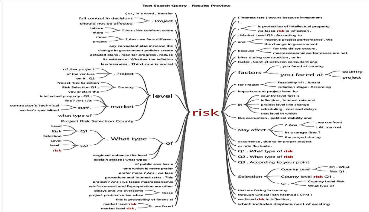
Figure 3: Word Search Query "Risk".