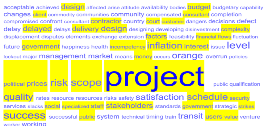
Figure 2: Word Cloud with Most Frequent Tags.

Figure 2 elaborates the Word Cloud Analysis; it visually presents the most frequent tags in the interview data. Different tags are highlighted according to the frequency of these tags repeated in data (Hearst & Rosner, 2008). World Cloud helps to identify the most significant RFs and SC highlighted by key stakeholders for OLMT project. After funneling approach, a minimum length of five alphabets is used in World Cloud Analysis to ignore the un-related words like years, indeed, etc. Major tags