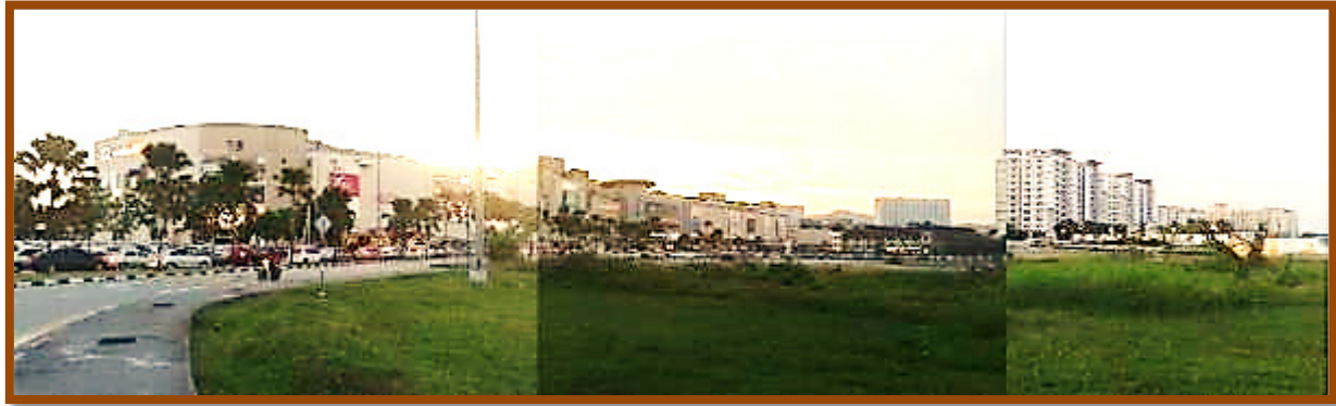
Figure 2: Queensbay districts from internal view shows a Queensbay Mall on the left, 3 storeys shop lot in the middle and high-rise apartment facing water front

scene in Penang. The construction of the mall, formerly known as the Bayan World Megamall, stopped in 1998 because of the Asian financial crisis. The project was abandoned for eight years, before fully completed by the end of 2006. The opening of the Mall is the beginning of the growth in this new city (Figure 2).