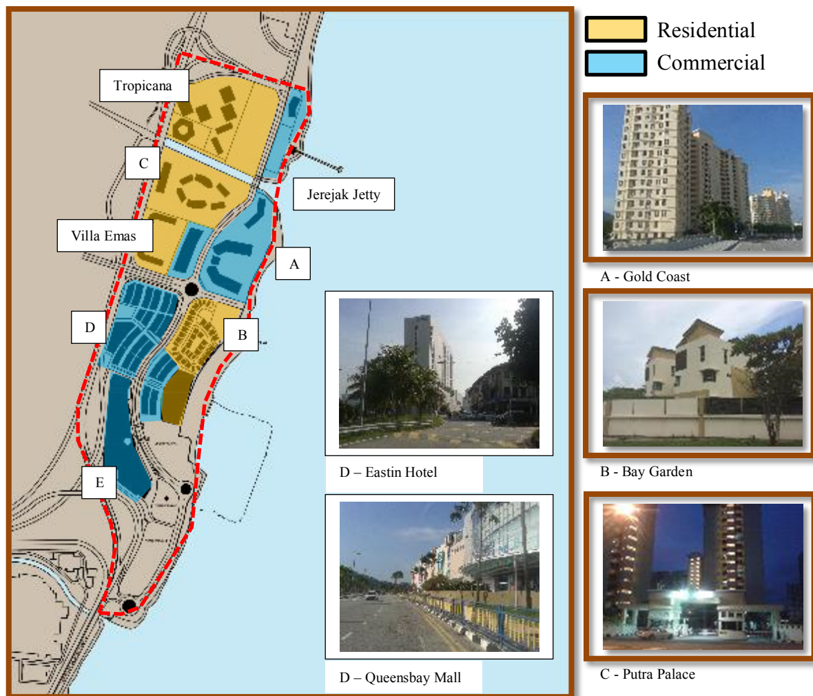
Figure 8: District for commercial and residential at Queensbay.

Districts in Queensbay for commercial and residential show in Figure 8.