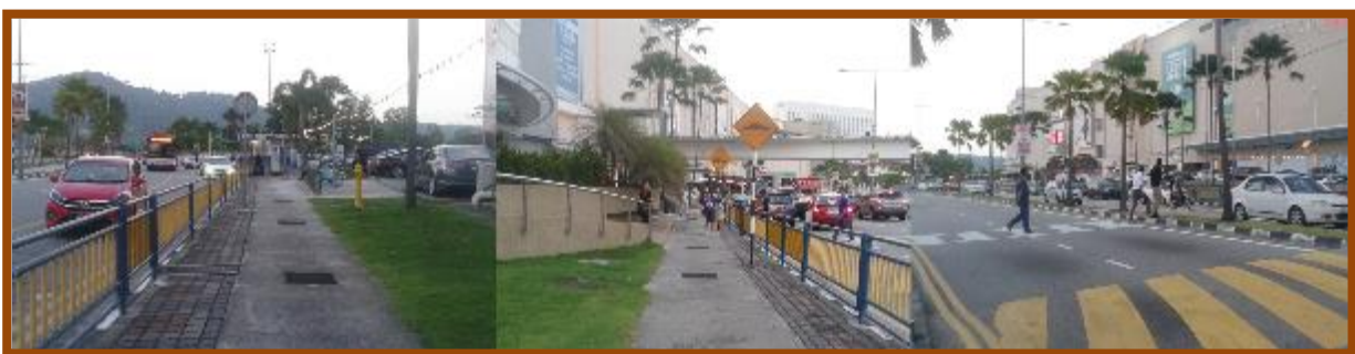
Figure 7: Pedestrian paths in front of queensbay and zebra crossing

Pedestrian paths show in Figure 7 connected people from a few nodes such as Kapitan Restaurant, Bus station and also from open parking besides Queensbay Mall. Both are connected by an efficient zebra crossing.