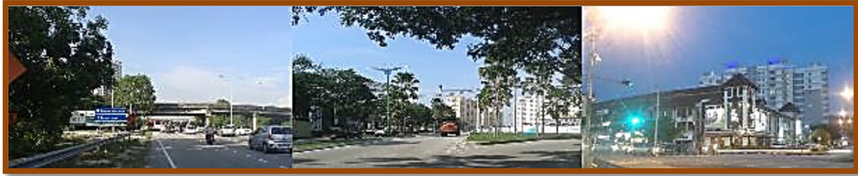
Figure 5: Vehicle path at entrance and internal road