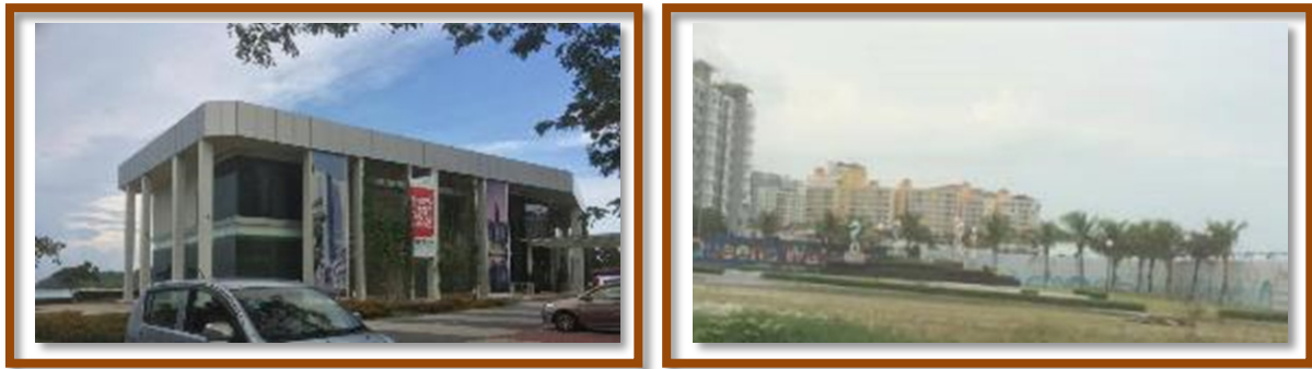
Figure 14: Penang World City's Gallery and Queens Waterfront @ Queensbay

Gridiron layout clearly marks not only borders of the land plots, but also public transport access. Provision of this transport access gives the authority traffic controls all over the settlement areas. All residents use these streets as a primary access for commercial routes (Hassan, 2001). The idea of primary access for commercial routes develops successfully parallel to the edge of the sea.