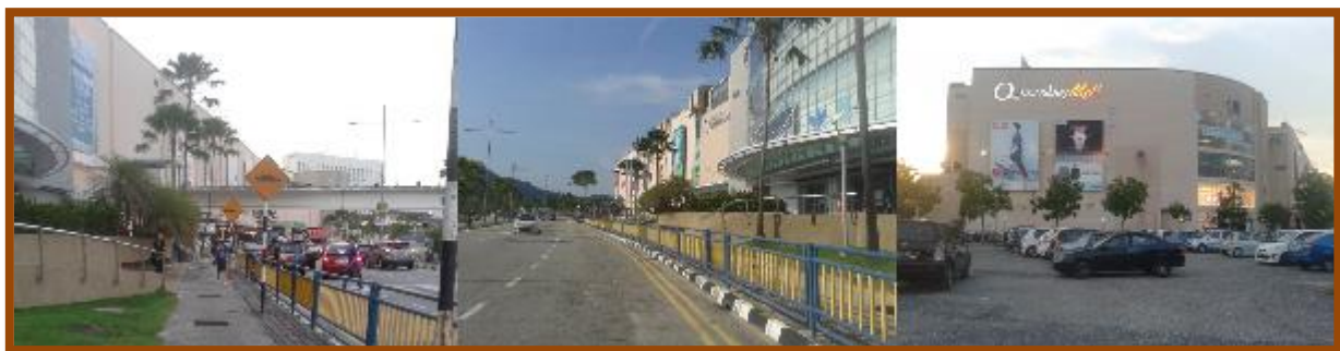
Figure 1: Queensbay Mall, Bayan Lepas, Penang

Queensbay (Figure 1) is a new upmarket waterfront development. It is located in the south-eastern seaboard of the island. The development consists of shop offices, corporate towers, hotel, bungalows, semi-ds, seafront villas, condominium, service apartment, and Queensbay Mall, the largest and longest shopping mall in Penang. 80 % of the land area has been designated for commercial use while the remaining 20% is residential (Adam Tan,2007).