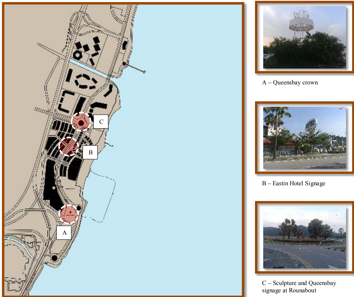
Figure 10: Landmarks at Queensbay district.

Queensbay crown is a sculpture, built together with the mall to highlight the building. It located at open space parking beside entrance to the south mall. Due to lack of maintenance, the sculpture was hidden and surrounded by trees and bushes. Second landmark that capture observer view is Eastin Signage. It was located at Jalan Persiaran Bayan Indah to attract customer from inner road. Main entrance to the hotel is from Lebuhraya Tun Dr. Lim Chong Eu. There have 3 roundabouts with difference sculpture or trees to create the differences. It is also become focal points to the sites. Signage and sculpture inside the roundabout was built to attract peoples' attention to the site.