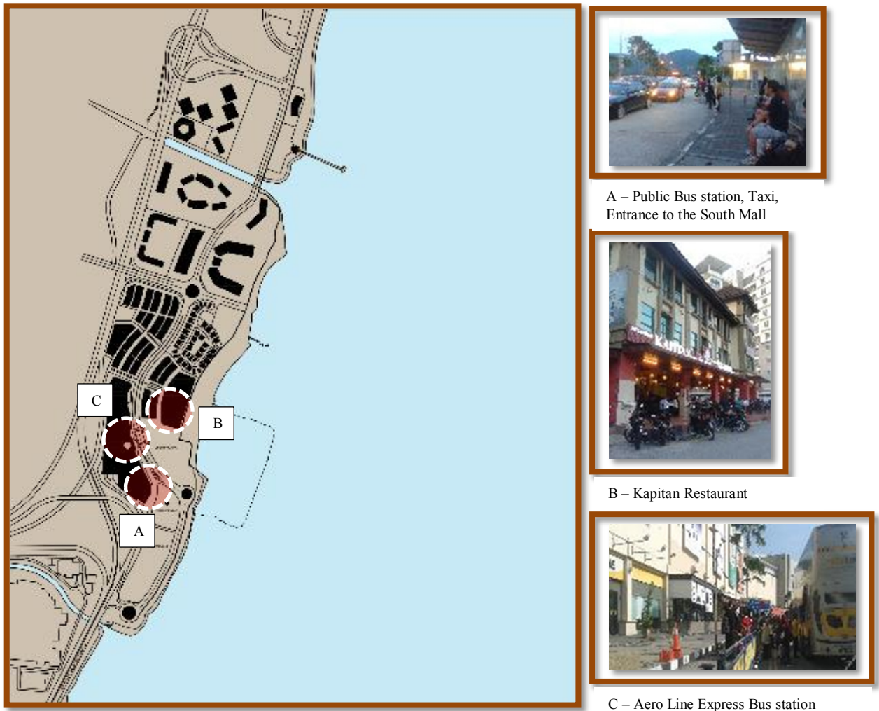
Figure 9: Nodes at Queensbay district

According to Lynch, nodes is a public place or space normally people use to gather. Refer to Figure 9, public bus station is a nodes whereby public buses, taxis, and public cars used to drop off passenger. The location is strategic, near to the south entrance to the mall, bicycle rent system, police center and open parking. Coffee bean area beside the main entrance, also being a node while waiting for friends and family before enter or exit the mall.