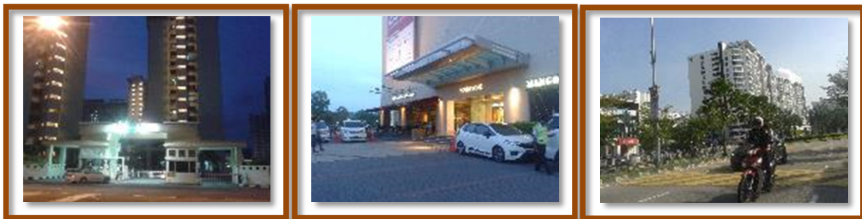
Figure 13: Putra Palace, South Entrance and Beer Factory.

Good physical characteristics of districts are determined by continuities and homogeneities of facades materials, textures, spaces, forms, details, symbols, building type, uses, Activities, inhabitants, colors, skyline topography, ...etc.(Lynch,1960). By looking to the composition of the buildings and land plot placement, Queensbay can be consider as a good layout for district combination between commercial and residential. Bay Garden was built to respect the similarity of the three stores shop lot besides. However, the idea of gated and guarded applied create a social boundary to the neighboring residence. It has been debate and discuss in several researchers regarding gated and guarded scheme and policy especially regarding strata title. Another disadvantage, there are possibility to of developer to exploit the prices due to the security purposed.