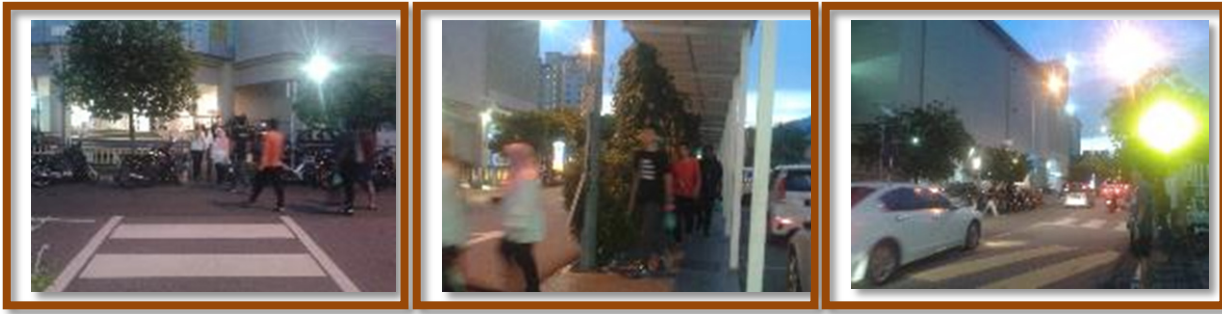
Figure 12: Zebra crossing at the collector road

It is indeed plausible that streets with more pedestrian-oriented activities (shops, restaurants, services, etc.) would be more memorable, and streets that have more people on them would be better remembered (M. Mohsenin, A. Sevtsuk, 2013). These shows, pedestrian activity inside the city helps the residents and user to memorized the place.