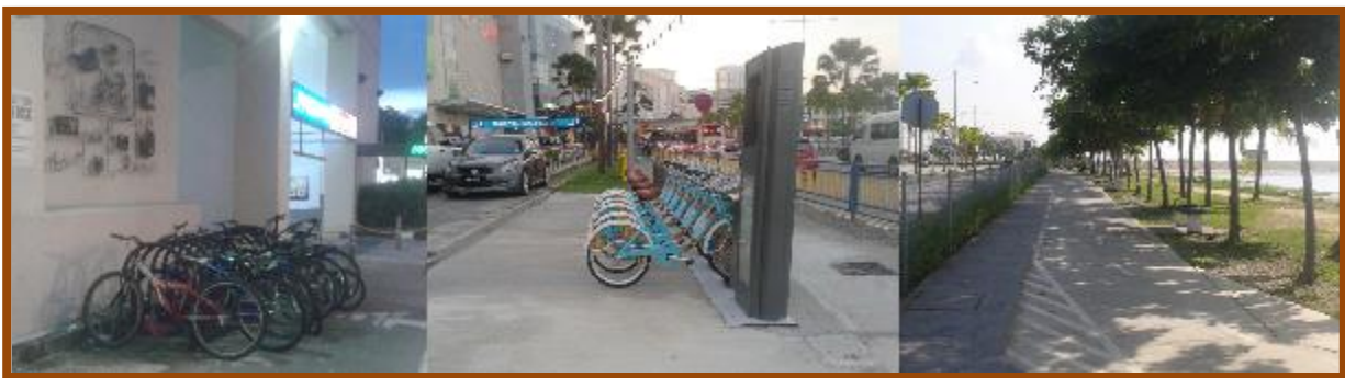
Figure 6: bicycle park located beside Queensbay Mall, bike sharing system in front of the mall and bicycle lane along the edge of the sea

Queensbay is one of the development who promote the use of bicycles by providing bicycle parking and bike trail (Figure 6). Link Bike is the IoT (Internet of Things) project from MBPP which is designed to best serve the community and the environment. (C.Lilian, 2017). The aim for bike-sharing system is to tackle traffic congestion as well as pollution. According to Lilian, there will be a total of 25 stations strategically scattered throughout the George Town area and other places on Penang island including Queensbay. Bicycle lane is also used by resident to do physical exercise and jogging.