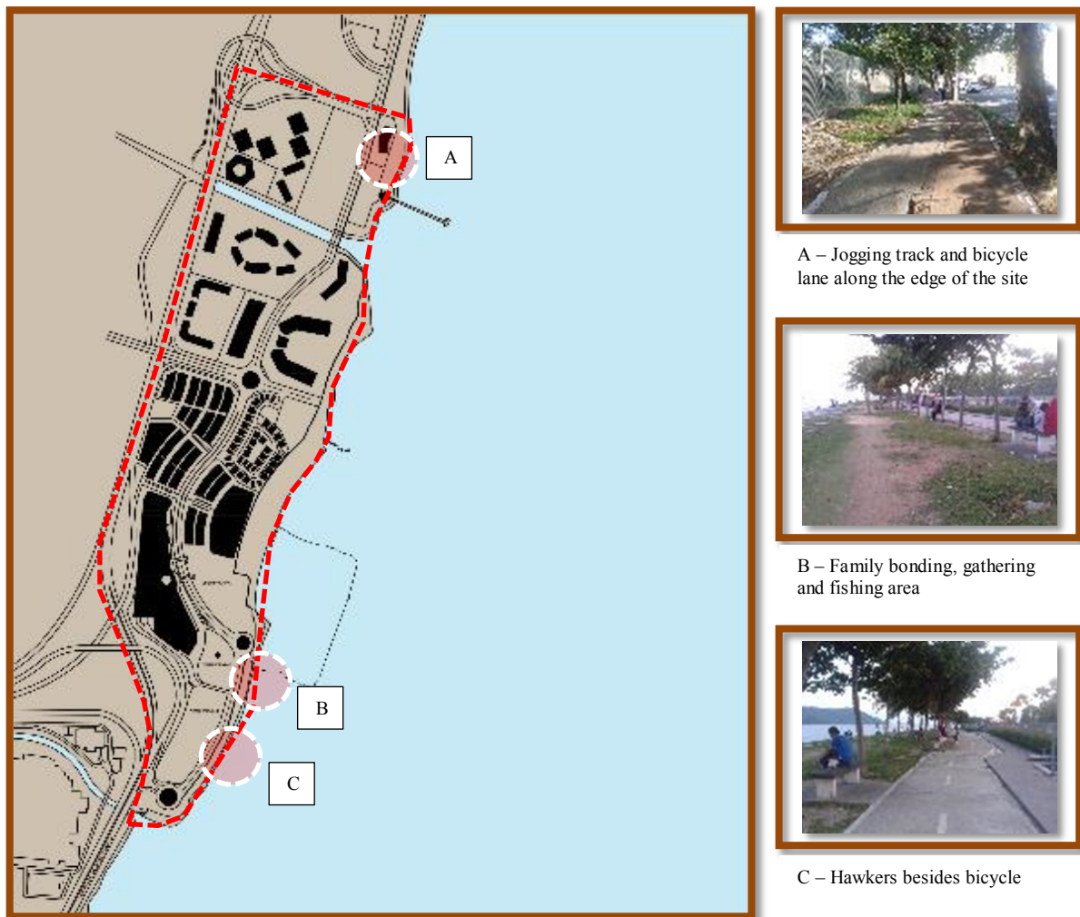
Figure 11: Edge at Queensbay district

Jogging and cycling is the most famous activity along the edge of Queensbay. The track was safe to continued until Persiaran Karpal Singh. Through the observer, the activity starts at 5 pm to 7.30 pm. There was a lot of activity as shown in location B and C. People love to see sea vista towards Pulau Jerejak and Old Bridge. Fishing activities with friends and family bonding's activities i.e. picnic, gathering scatted along the sea shore. Many hawkers truck selling snacks and roasted corn was park along the road to serve the needs. The activity also creates temporary nodes to the site.