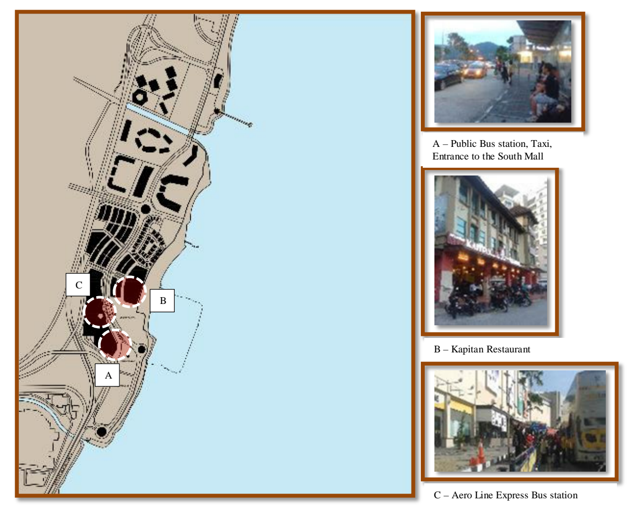
Figure 9: Nodes at Queensbay district

According to Lynch, nodes is a public place or space normally people use to gather. Refer to Figure 9, public bus station is a nodes whereby public buses, taxis, and public cars used to drop off passenger. The location is strategic, near to the south entrance to the mall, bicycle rent system, police center and open parking. Coffee bean area beside the main entrance, also being a node while waiting for friends and family before enter or exit the mall.