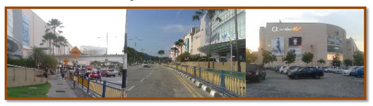
Figure 1: Queensbay Mall, Bayan Lepas, Penang

Queensbay (Figuare 1) is a new upmarket waterfront development. It is located in the southeastern seaboard of the island. The development consists of shop offices, corporate towers, hotel, bungalows, semi-ds, seafront villas, condominium, service apartment, and Queensbay Mall, the largest and longest shopping mall in Penang. 80 % of the land area has been designated for commercial use while the remaining 20% is residential (Adam Tan,2007).