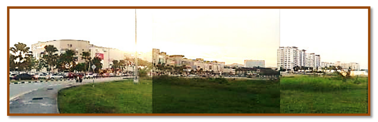
Figure 2: Queensbay districts from internal view shows a Queensbay Mall on the left, 3 storeys shop lot in the middle and high-rise apartment facing water front

scene in Penang. The construction of the mall, formerly known as the Bayan World Megamall, stopped in 1998 because of the Asian financial crisis. The project was abandoned for eight years, before fully completed by the end of 2006. The opening of the Mall is the beginning of the growth in this new city (Figure 2).