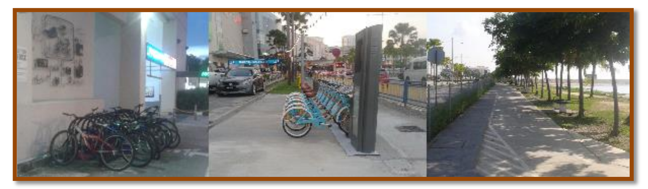
Figure 6: bicycle park located beside Queensbay Mall, bike sharing system in front of the mall and bicycle lane along the edge of the sea

Queensbay is one of the development who promote the use of bicycles by providing bicycle parking and bike trail (Figure 6). Link Bike is the IoT (Internet of Things) project from MBPP which is designed to best serve the community and the environment. (C.Lilian, 2017). The aim for bike-sharing system is to tackle traffic congestion as well as pollution. According to Lilian, there will be a total of 25 stations strategically scattered throughout the George Town area and other places on Penang island including Queensbay. Bicycle lane is also used by resident to do physical exercise and jogging.