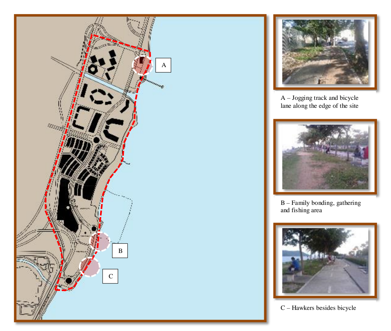
Figure 11: Edge at Queensbay district

Jogging and cycling is the most famous activity along the edge of Queensbay. The track was safe to continued until Persiaran Karpal Singh. Through the observer, the activity starts at 5 pm to 7.30 pm. There was a lot of activity as shown in location B and C. People love to see sea vista towards Pulau Jerejak and Old Bridge. Fishing activities with friends and family bonding's activities i.e. picnic, gathering scatted along the sea shore. Many hawkers truck selling snacks and roasted corn was park along the road to serve the needs. The activity also creates temporary nodes to the site.