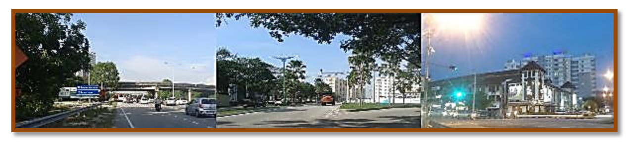
Figure 5: Vehicle path at entrance and internal road