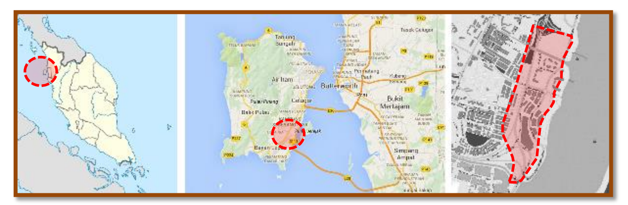
Figure 3: Key Plan of Penang, Location Plan and Limit of study at Queensbay, located at Bayan Lepas Distric, Penang.

Queensbay is midway between the Old Penang Bridge interchange and the Bayan Lepas Industrial Park. It is also situated in the declared area as the Penang Cybercity 1 (PCC1) which forms part of the Multimedia Super Corridor (MSC). Accessibility to Queensbay is supported with excellent infrastructure via the dual carriageways of Bayan-Lepas Jelutong expressway whilst benefiting from its close linkage to alternative routes such as Jalan Sultan Azlan Shah, Jalan Tun Dr Awang and Jalan Aziz Ibrahim. Queesbay 's location will further be enhanced with the new second link bridge and the development of Penang Outer Ring Road (PORR) carriageway connecting main land to Gurney Drive in the future (Figure 3).