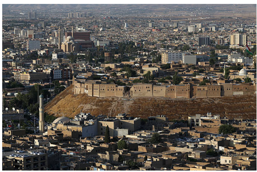
Figure 2: Erbil city heritage citadel.