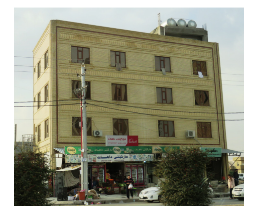
Figure 7: (Left) Sultan M. Street; (Right) Rasti district