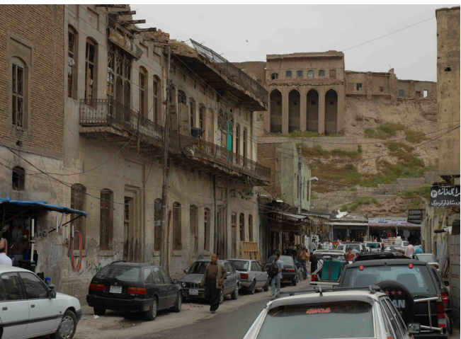
Figure 1 : (Left) Modern construction; (Right) Heritage values.

In the other hand, scholars in the field of architectural design (Kermani & Alalhesabi, ,2016; Mansouri & Torabi,2015; Derya & Alkan,2015; Kiera,2011; Mansoori & Jahanbakhsh,2014; ) focus on physical aspects of heritage buildings as evidence of past civilizations which have a significant architectural and historical value. In general, heritage is a term that is used to illustrate a set of values, and principles, of the past. It is a slippery term that includes a vast range of paradoxical meanings which is in fact a very difficult concept to define (Figure 2). It is basically traditions that get carried down generation to generation by sustaining the continuity of the social and cultural values. It is what creates a sense of identity and assures rootedness and continuity.