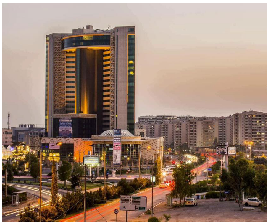
Figure 3: Commercial buildings in Erbil City.