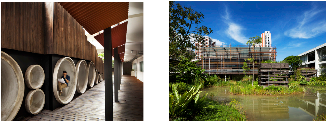
Figure 3: The integration of architectural elements with the landscape.

Enabling Village is the rejuvenation and adaptive project of reusing the masterplan of Bukit Merah Vocational Institute built in 1970s. Before the re-development, the masterplan did not contribute to the neighbouring users. Then, the reimages of this new masterplan take the consideration of providing linkages to the neighbourhood by seamless connecting ramps, landings and elevators. This community building integrates various program for the communal uses such as work, training, retail and living lifestyle as well as connecting people with disabilities and the society.