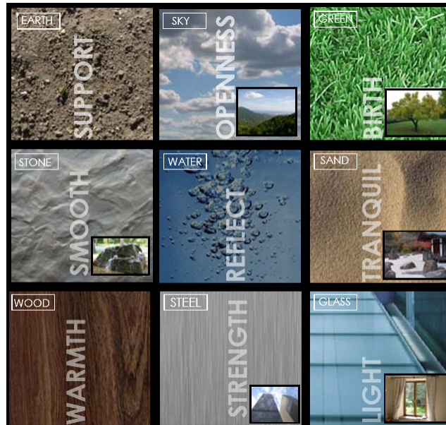
Figure 9: Materiality affected on healing environment

receptor will construct a visual and psychological perception in experiencing a space. In order to achieve this kind of spatial quality, architecture and nature must be seemed to be coexisted and its presence can be noticed and appreciated.