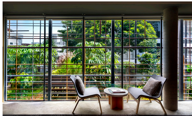
Figure 6: Indoor quality of Enabling Village.

urban context through indirect participation and communication between the users and space.