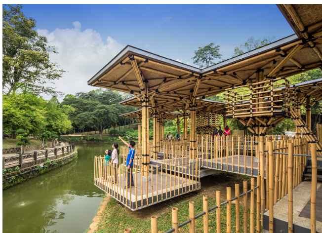
Figure 5: Split levels and different platform height evoke various emotions

Moreover, the manifestation of the Bamboo Playhouse to portray the natural environment will have high tendency to support any healing reactions to occur in user's mind, Figure 5. The imitation of tree through its columns and correlation with its setting allows the structure and its spaces to inherit various properties as similar as the existing culture and environmental situation it originated. The biomimetic approach also gives the flavor to the ordinary space to be more unique and stronger in character making. The setting for the structure is at the edge of the lake making the pavilion having a close relationship with the lake and engaging with the idea of partiality. This concept idea evolved a unique dialogue with the lake and natural surrounding as a unified architectural built form with its context.