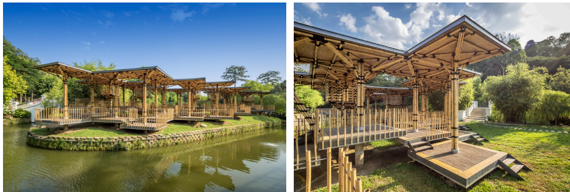
Figure 1: Overall perspective of Bamboo Playhouse.

Eleena Jamil Architects, Figure 1 uses bamboo as the main construction material for this pavilion as consider as very unusual for Malaysia to use this kind of sustainable material. This design explores the potential of bamboo to imitate the overall concept of playhouse and portrays the characteristics of ‘wakaf’, a vernacular structures found in Malaysia’s villages. This open structure pavilion is the repetition of raised square platform ‘wakaf’ that grouped together with multiple levels to form a united playful bamboo structures.