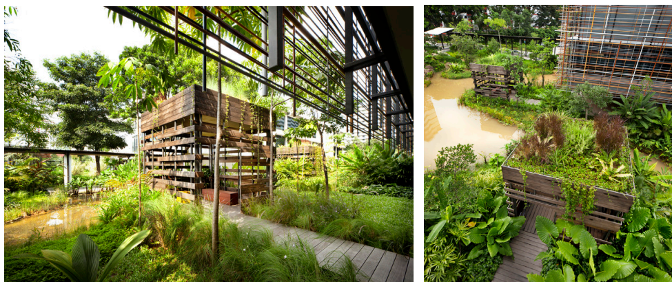
Figure 7: Porosity in space planning and integration with landscape.

On the other hand, permeability and transparency of the building envelope plays as vital element as major architecture built form in space quality making. Building envelope is the catalyst to the reaction between emotions, feeling and spaces to widen more possibilities to trigger stimulus so that healing process can happen. WOHA Architect taking a brilliant step and approach to infused its signature façade design to the building envelope of Enabling Village's building. The permeable building façade elements will allow indoor space to have a direct interaction with the surrounding elements. Figure 6, this will grant natural lights to penetrate, interesting shadows to cast and nature sounds to emerge into the space. These ingredients will stimulate human senses within an inactive space and to certain extend evoke healing sensations. This ambiance is also allows human perception to create a mental mapping for the sensorial information to retain as a memory while experiencing the space.