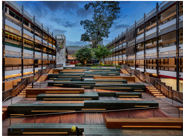
Figure 8: Appreciation of natural topography.

perceived by users when go through inclined or declined surface. Inclined surface of the ramp for example can switch on the challenge mood while declined surface will exhilarates and provokes joy to the persona. The different in gravity will eventually affect the degree of acceleration on the potential movement of the user. Hence, the different surface and arrangement of spaces have important role in expressing it power of existence towards healing factor, Figure 8.