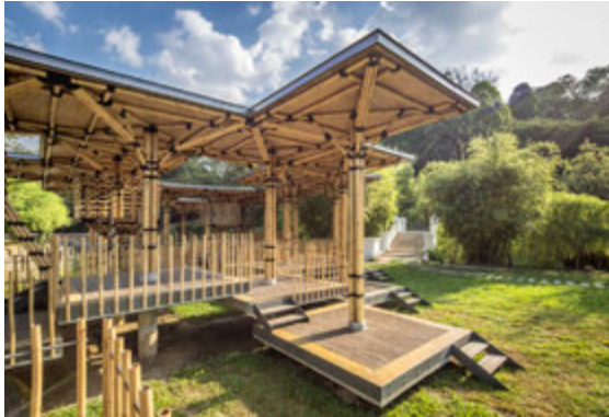
Figure 1: Overall perspective of Bamboo Playhouse.

Eleena Jamil Architects, Figure 1 uses bamboo as the main construction material for this pavilion as consider as very unusual for Malaysia to use this kind of sustainable material. This design explores the potential of bamboo to imitate the overall concept of playhouse and portrays the characteristics of 'wakaf', a vernacular structures found in Malaysia's villages. This open structure pavilion is the repetition of raised square platform 'wakaf' that grouped together with multiple levels to form a united playful bamboo structures.