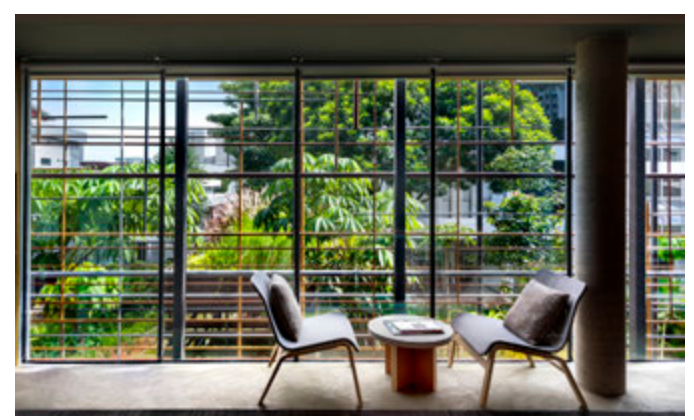
Figure 6: Indoor quality of Enabling Village.

urban context through indirect participation and communication between the users and space.