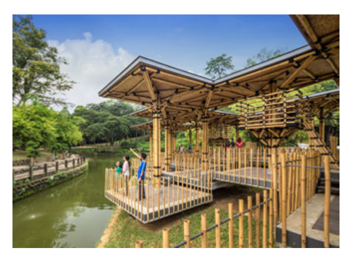
Figure 5: Split levels and different platform height evoke various emotions

Moreover, the manifestation of the Bamboo Playhouse to portray the natural environment will have high tendency to support any healing reactions to occur in user's mind, Figure 5. The imitation of tree through its columns and correlation with its setting allows the structure and its spaces to inherit various properties as similar as the existing culture and environmental situation it originated. The biomimetic approach also gives the flavor to the ordinary space to be more unique and stronger in character making. The setting for the structure is at the edge of the lake making the pavilion having a close relationship with the lake and engaging with the idea of partiality. This concept idea evolved a unique dialogue with the lake and natural surrounding as a unified architectural built form with its context.