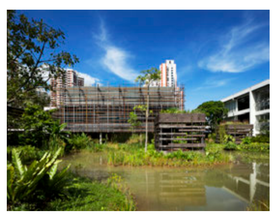
Figure 3 : The integration of architectural elements with the landscape.

This community building is targeted to provide and deliver a better holistically integrated environment with the architecture. The new main building is anchored with the main pond that functions as a beacon to draw the pedestrian flow through improved linkages. There is a timber terrace plastered over the main courtyard at the Playground, stepping and ramping down the amphitheater, Figure 3. Open spaces and resting area are merged very well with the design by making uses of the pocket spaces such as below the amphitheater, around the courtyard and garden. The Enabling Village focuses on sustainability and sociability by promoting the learning, bonding and healing of people with varying abilities within a biophilic environment. This creates an inclusive space that enables and values everyone.