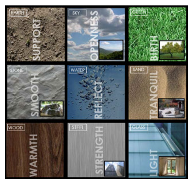
Figure 9: Materiality affected on healing environment

receptor will construct a visual and psychological perception in experiencing a space. In order to achieve this kind of spatial quality, architecture and nature must be seemed to be coexisted and its presence can be noticed and appreciated.