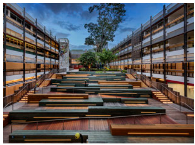
Figure 8: Appreciation of natural topography.

perceived by users when go through inclined or declined surface. Inclined surface of the ramp for example can switch on the challenge mood while declined surface will exhilarates and provokes joy to the persona. The different in gravity will eventually affect the degree of acceleration on the potential movement of the user. Hence, the different surface and arrangement of spaces have important role in expressing it power of existence towards healing factor, Figure 8.