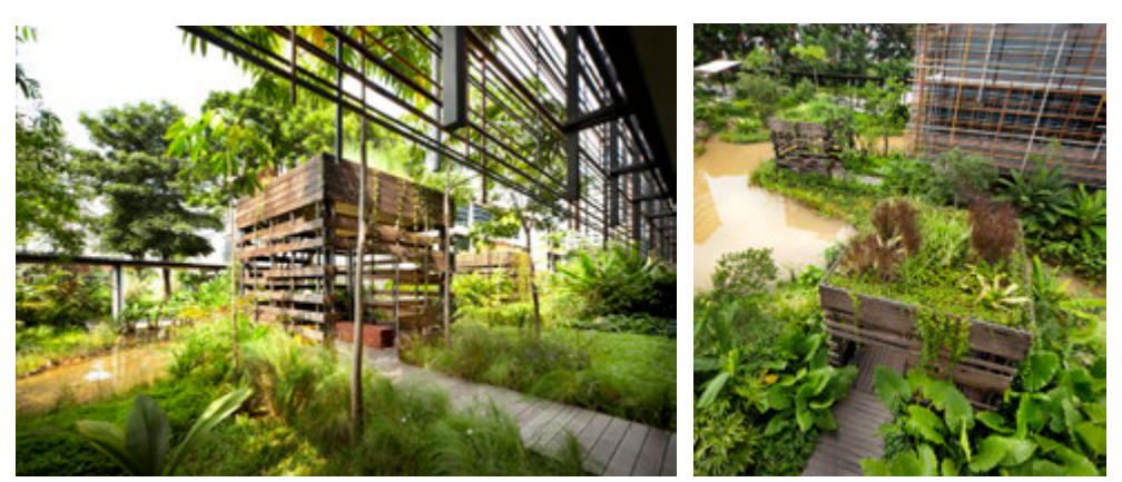
Figure 7 : Porosity in space planning and integration with landscape.

On the other hand, permeability and transparency of the building envelope plays as vital element as major architecture built form in space quality making. Building envelope is the catalyst to the reaction between emotions, feeling and spaces to widen more possibilities to trigger stimulus so that healing process can happen. WOHA Architect taking a brilliant step and approach to infused its signature façade design to the building envelope of Enabling Village's building. The permeable building façade elements will allow indoor space to have a direct interaction with the surrounding elements. Figure 6, this will grant natural lights to penetrate, interesting shadows to cast and nature sounds to emerge into the space. These ingredients will stimulate human senses within an inactive space and to certain extend evoke healing sensations. This ambiance is also allows human perception to create a mental mapping for the sensorial information to retain as a memory while experiencing the space.