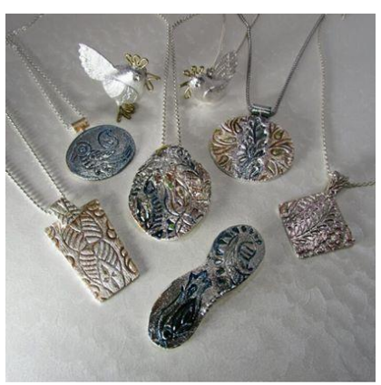
Figure 4 : Examples of products from plastic metal masses Mitsubishi Materials Corporation MJC[8]

highest form of activity inherent in man alone, one of the foundations of human life, culture, its result is the manifestation of the essential qualities of a person. The role of creativity is so important in a person's life that it is used as a restorative art therapy. Therefore, people with disabilities often find an outlet to their potential in the works. A person isolated from the world due to illness can create works of art [17].