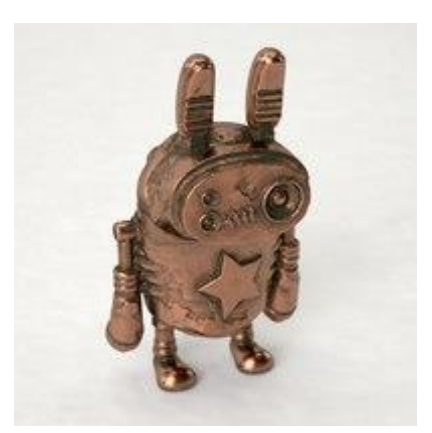
Figure 5 : Bronze figure "Usarobo001" made of metal plastic mass