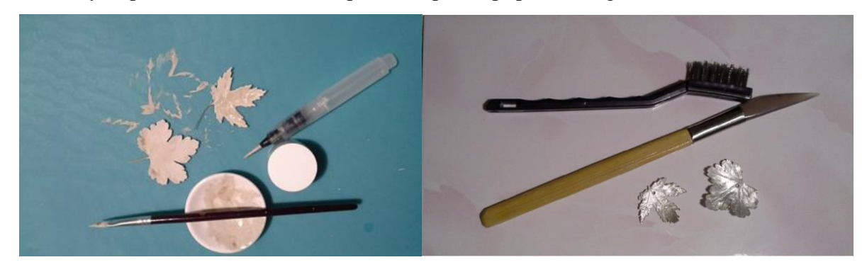
Figure 2 : Creating a pendant based on natural materials using plastic metal paste in the form of a paste [13]

material is easy to process and does not require complex equipment (Figure 3).