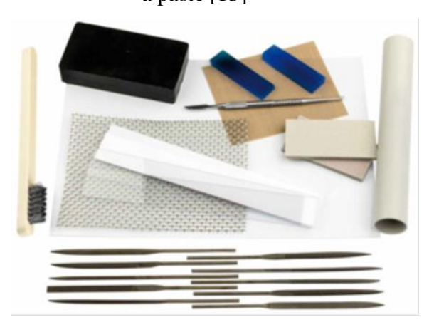
Figure 3: Tools for work [5]

These materials and technologies may interest people with disabilities. Such an effective way of rehabilitation of people with disabilities, such as clay therapy [11], which is basically based on work with plastic material, has long been known and used. Working with plastic metals can help people with disabilities believe in themselves and their capabilities, rehabilitate and integrate into society, uncover and realize their creative potential. Unusual jewelry (Figure 4) and souvenirs (Figure 5) can be created from plastic metals, which can become not only a hobby, but also an opportunity to earn [3-4].