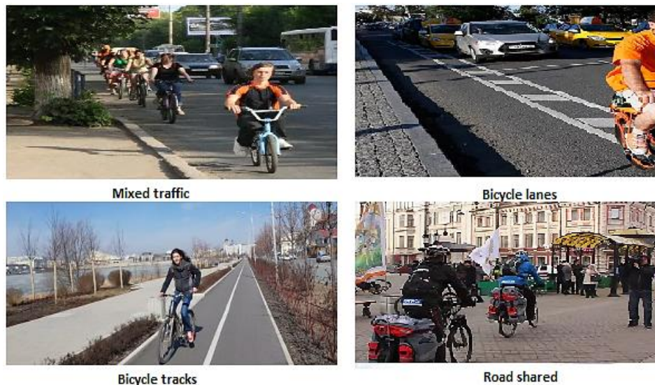
Figure 2: Types of bicycle roads/tracks between Kazan Federal University and the university village