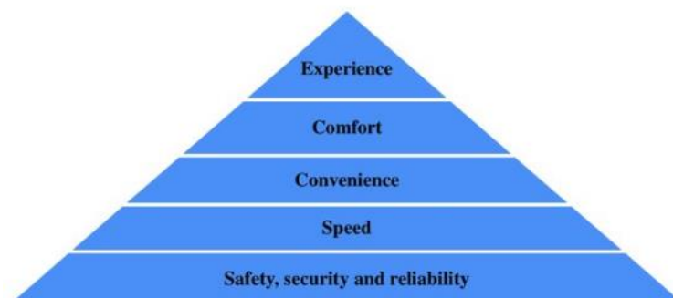
Figure 1: Maslow Transportation Level of Service in public transport (after [6]).

We tried to cover the basic needs as the prevention of road accidents and also offer a secure bike parking (Figure 1). These factors would give us convenience and comfort when we use the alternative bicycle road [6,7].