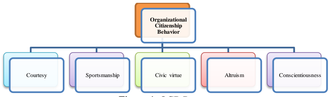
Figure 1: OCB Pattern