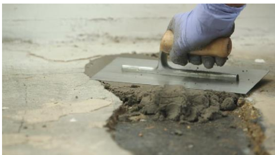
Figure 3: Grouting application using the chains of long polymer molecules reinforcement.

The grout reinforcement is necessary not only for the formation of thixotropic properties but also to maintain suspension. It is important to prevent the formation of sludge in the pipes and pumps of the tunnel complex at the time of stopping during ring mounting. If the installation of one ring will take 3-4 hours, and the freezing time of the solution is 6 hours, with round-the-clock penetration, you will not have to waste time washing the pumps and channels. They will be cleaned in the following portions of the solution. Figure 3 shows the maintaining cement by using polymer reinforcement of the grout with the chains of long polymer molecules in practical. Figure 4 shows a tunnel needing maintenance.