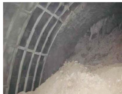
Figure 4: Tunnel maintenance

The first step after tunnel drilling is to control the tunnel stability to ensure the safety required during drilling and their long-term stability. In general, the Earth is under natural, gravity and tectonic forces. As a result of tunnel excavation, the balance between these forces is disrupted and a new stress situation is created which may cause the ground around the tunnel to break down.