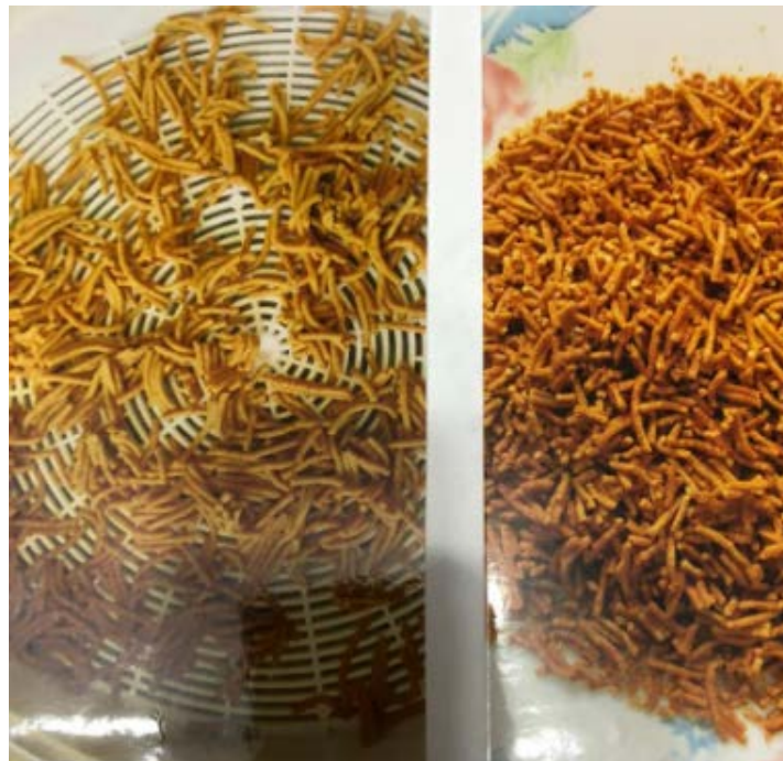
Figure 3: General view of protein-vitamin granulate.

characteristic pronounced color, taste, and aroma corresponding to the raw materials used (Figure 3).