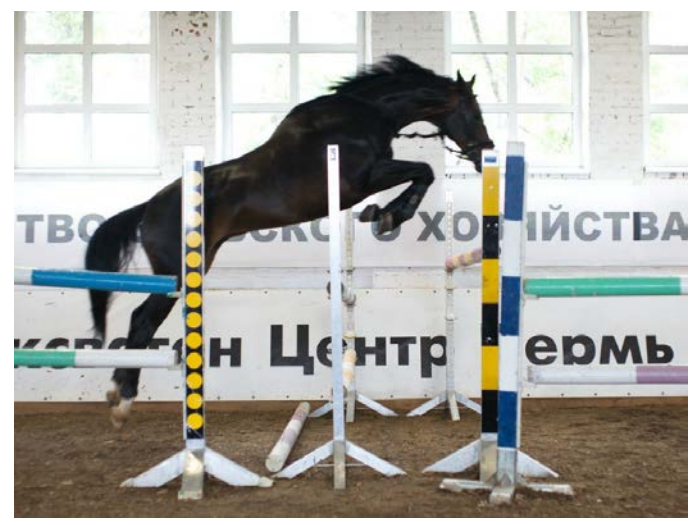
Figure 1: Leap of the horse.

The horse's jump implies a strong flexion of the hind and forelimbs (Figure 1).