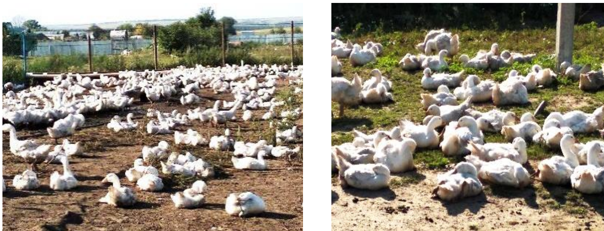
Figure 1: Geese of the Lindovskaya Breed, Research and Production Experiments of this study.

Research and production experiments were carried out in the summer-autumn period based on “Akhmetov R.Kh.” peasant-farm in the Vysokogorsky district of the Republic of Tatarstan (Figure 1). Geese at the age of 30 days were divided into five groups, 500 animals in each, according to the principle of analogue groups by age, live weight, and sex.