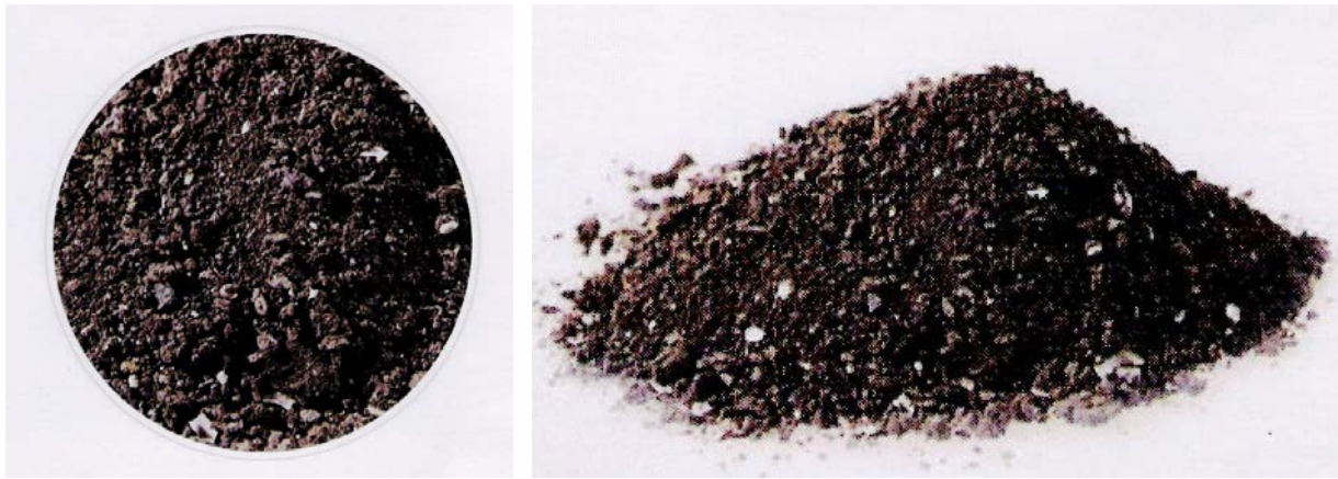
Figure 2: Sapropel dried deposits of Lake Belye (Russia).

Using sapropel and nanostructured sapropel in different doses for feeding geese resulted in increased live weight gain (Table 1).