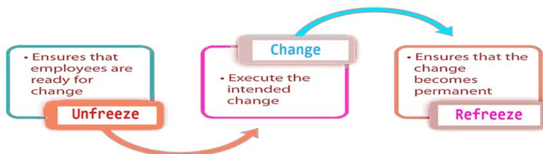
Figure 1: Model of change (Lewin, 1947).

Lewin's model of Change: Lewin's (1947) have proposed the model of change in which three steps are formulated to accept the change can be a useful tool in global pandemic situations (Figure 1). The suggested three dimensions of the model are the best fit to diagnose and implement the change. The first step 'unfreeze' involves that business organization must realize the need for bringing change and hence, the current working process must be modified with several means with relevance to the current pandemic situations. In continuation, the communication of the change process has also an important impact and should be available for every organizational member (Lloyd and Walker, 2011).