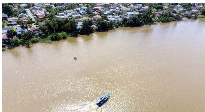
Figure 10: The Sarawak River and Kampung Bintawa Hilir

The Sarawak River (Figure 10) is directly reachable from Kampung Bintawa Hilir jetty. The locals are vigorously promoted to either go across the river to the opposite waterfront or go to other neighbouring villages. This river allows several public modes of transportation to operate, like the water taxi and river cruise.