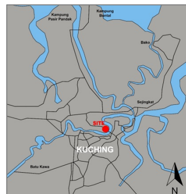
Figure 2 : Location Plan (Kampung Bintawa Hilir, Kuching)