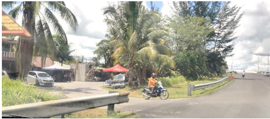
Figure 6: Main entrance of Kampung Bintawa Hilir from Tun Salahuddin Expressway