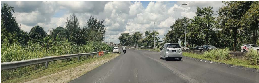
Figure 5: Tun Salahuddin Expressway near the Kampung Bintawa Hilir

The Tun Salahuddin Expressway is considered a transition between north and south of Kuching city (Figure 5), and it is the only highway near the Kampung Bintawa Hilir . The villagers regularly travel via the Tun Salahuddin Expressway and via Jalan Kampung Bintawa Tengah where it is from another settlement for to and fro of the Kuching city. After travelling via Tun Salahuddin Expressway , a road connects to the arterial road and the collector road to access Kampung Bintawa Hilir .