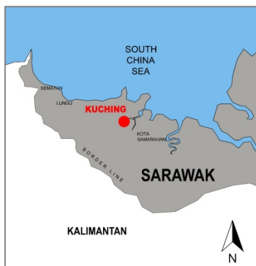
Figure 1: Key Plan (Kuching, Sarawak).

Kampung Bintawa Hilir is a traditional Malay village sited across the Sarawak River (Figures 1 & 2). It is one of the earliest Malay settlements in Kuching that existed in the 19 th century during the Brooke era (Chon, 2000). The current kampung shows a high density of low-rise residential housing consisting of 700 houses, mostly one-storey houses. The residents are mostly low-income groups, and the ethnic background is mostly Malay (Utusan, 2019). Most kampung residents work as manual labour at the Pending Industrial Estate, located just across the river. Few own a small sampan would work as a fisherman or river taxi at the downstream of Sarawak River near Kuching Central Business District (CBD) to bring tourists across from one site to another (Ruekeith, 2010).