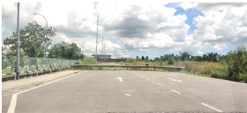
Figure 8: The end of arterial roads Kampung Bintawa Hilir

The arterial roads (Figure 8) of Kampung Bintawa Hilir can be connected and sharing the same route with Jalan Kampung Bintawa Tengah and Jalan Kampung Bintawa Hilir . The width average of arterial roads is about 6 meters, including two-lane, which consist of two ways—a total of 1.14 km distance for arterial roads of Jalan Kampung Bintawa Hilir .