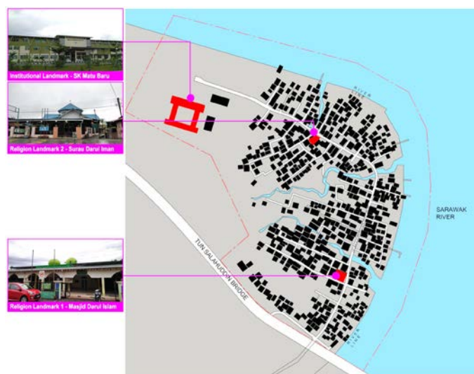
Figure 15: Figure-Ground Layout Plan showing landmarks around Kampung Bintawa Hilir

Figure 15 shows that there are three (3) landmarks in Kampung Bintawa Hilir – two (2) religious landmarks and one (1) institutional landmark. The landmarks are recognised by the people's popularity, not only from the localities and outsiders but also from the point of reference. Its level of dominance determines the hierarchical order of the landmarks (Tables 7 & 8).