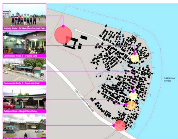
Figure 13: Ground Layout Plan showing nodes around Kampung Bintawa Hilir

According to Kevin Lynch (1960), nodes are the strategic focal points that are generally perceived as junctions of roads. This space bifurcates and connects paths to different directions and also open spaces such as plazas (Figure 13). There are four (4) types of nodes in Kampung Bintawa Hilir – Traffic Node, Religion Node, Commercial Node, and Activity Node. The hierarchical order is determined by the level of socio-activity of the nodes (Tables 5 & 6).