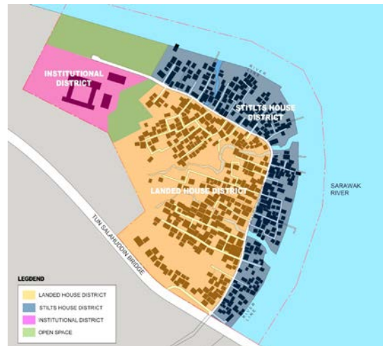
Figure 12: Figure-Ground Layout Plan showing the Districts of Kampung Bintawa Hilir

From the study (Figure 12), there are two (2) main types of districts in Kampung Bintawa Hilir – a Residential district and an Institutional district (locals refer to as a School district). In contrast, the residential district is further detailed into the Landed house and Stilts house district. These districts are differentiated based on building usage and building form. The hierarchical order is determined based on the size of the districts (Table 4).