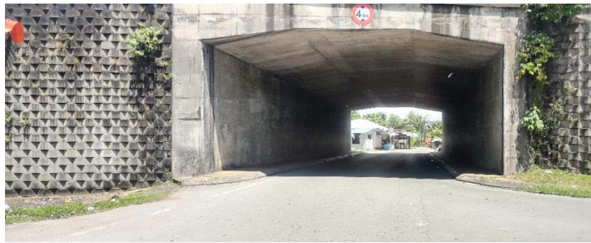
Figure 7: Secondary entrance of Kpg Bintawa Hilir from Jalan Kampung Bintawa Tengah