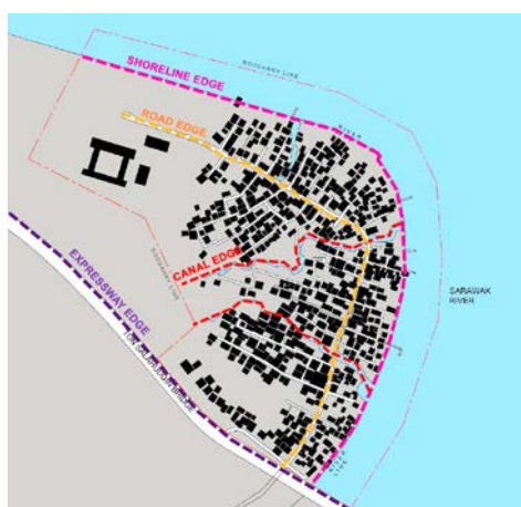
Figure 11: Edges of Kampung Bintawa Hilir

The edge is usually the boundary between two differential areas (Lynch, 1960). It is less noticeable by people who do not have a robust cognitive map of the site. There are three types of edges perceived by the localities in Kampung Bintawa Hilir – Shoreline Edge, Road Edge, and Canal Edge (Figure 11). The most dominant edge (Table 3) is the shoreline edge along the village's riverbank, and the total distance of the edges is about 1.35 km. A secondary edge is identified as the