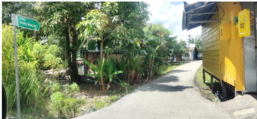
Figure 9: The collector road of Lorong Kampung Bintawa Hilir 2