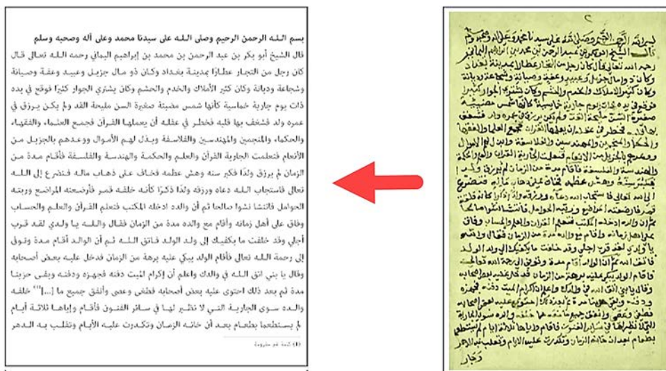
Figure 3: A project on digitization of manuscripts, while in the right part appears a high-quality processed image of the Arabic language manuscript, and the left part of the same page after digitization thereof.

The importance of the manuscript remains, even with the presence of the printed book therefrom, because the value of the manuscript does not come only from the words it contains, but its supreme merit comes from it being a work of art from the era of mechanical production, its temporal and spatial existence, the types of calligraphy, its decoration, its relationship to the era, and its history. This makes the manuscript an open window on the art of calligraphy and the science of drawing the letter and its significance. Due to the scarcity of some of these manuscripts, the damage in some of the papers, or the lack of clarity about the calligraphy, there was great difficulty in them being accessible as a treasure of knowledge and benefiting users with their science and knowledge.