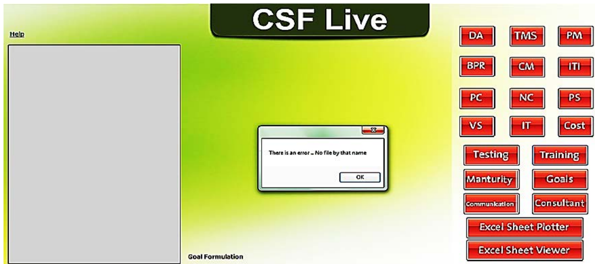
Figure 4: Training.

In the case of not implementing some or all of the previous steps, the following message will appear when the user clicks on any of the buttons corresponding to any of the critical success factors as shown in Figure 4.