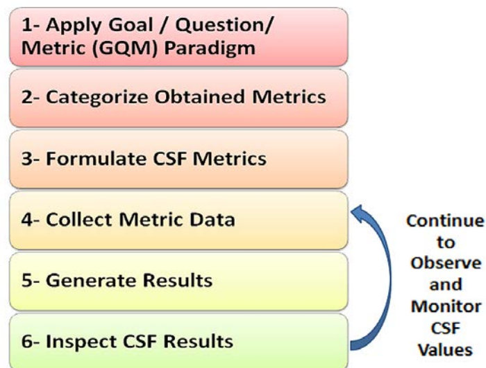
Figure 2: Steps of Framework for Measuring CSFs [10]

We present a study of the previous research that focuses on developing a method (CSF-Live) that represents our proposed framework for measuring CSFs [10]. The purpose of the CSF-Live method is to measure, track, monitor, and control the critical success factors during the implementation of large-scale software systems by using the Goal/Question/Metric (GQM) paradigm. The CSF-live method has six steps as shown in Figure 2 [10].