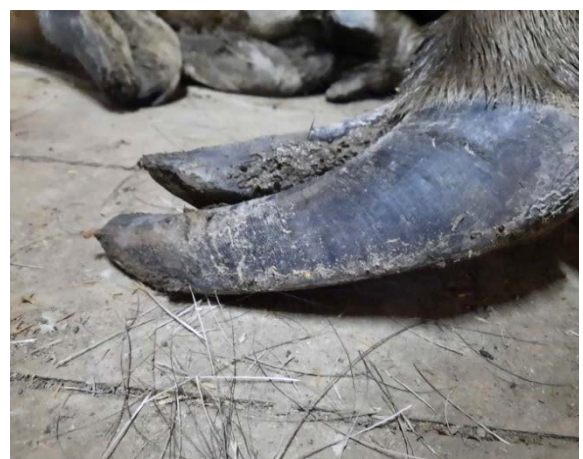
Figure 2: Moose cow with severe hoof lesions