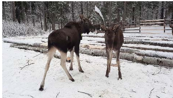
Figure 1: Moose Grazing Forage Areas

In the last period of pregnancy, the broodstock, being in the winter camp since January 15, received large quantities of oatmeal, rich in crude protein. Protein overfeeding in combination with physical inactivity caused by difficulty in movement in deep snow conditions, the confinement of elk to feeding grounds (Figure 1) contribute to the development of hoof pathologies and related diseases.