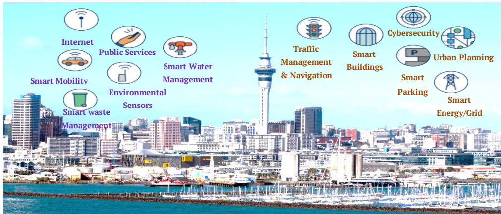
Figure 2: An instance of a smart city [3].

In a Smart City, a composite network of interrelated sensors, devices, and software must be constructed and preserved. This should permit the city to become a more maintainable and proficient atmosphere for its residents.