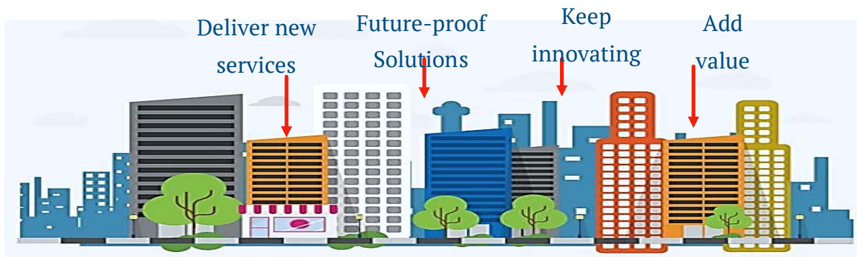
Figure 1: Internet of Things with Smart Cities [2].

The Internet of Things (IoT) in current trends has emerged as a novel communication platform with intends to bridge an innovative framework to the massive digital device network with the use of the internet. IoT promotes various sensing, actuation, and computing abilities to remote devices and sensors with the Internet giving rise to new services in the landscape of Smart Cities. Smart city concepts are either being adopted or looking forward to being adopted due to their functionalities, Big Data Analytics, and fascinating possibilities. The current challenges such as traffic congestion and waste management will be addressed easily, added to this, better infrastructure, more efficient transport structures reduced traffic jamming and overcrowding, proper waste managing, and improve human life eminence can be achieved. A smart city is an ecosystem of complicated units involving statistics and message passing technologies intending to recover cities sustainability, livelihood as well as standard of living.