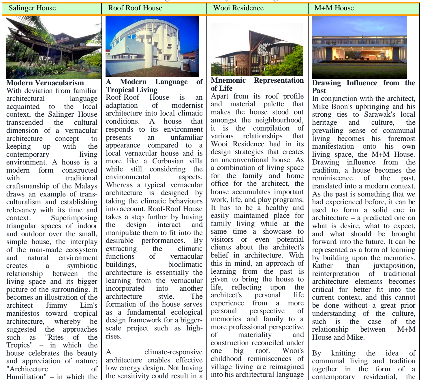
Table 1: Findings from the analyses of the eight houses.

The findings of the eight houses based on the re-drawing analyses and observations of the houses and interviews with the architects are presented in Table 1.