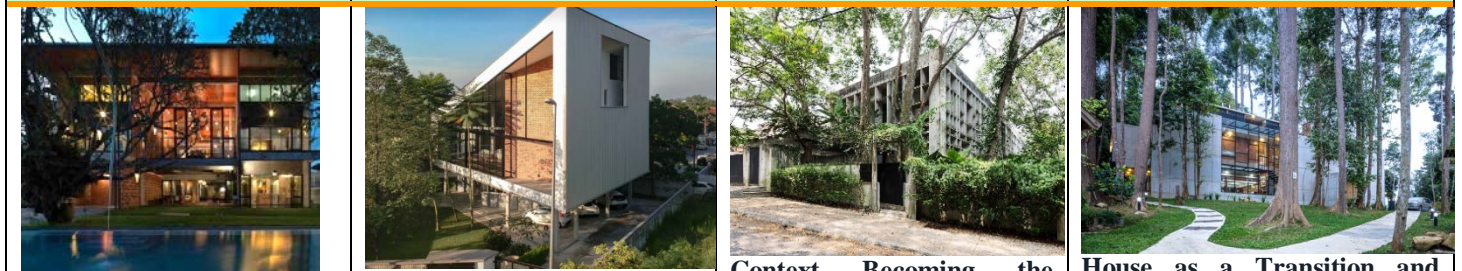
S11 38 Mews Chempennai House Twinkle Villa