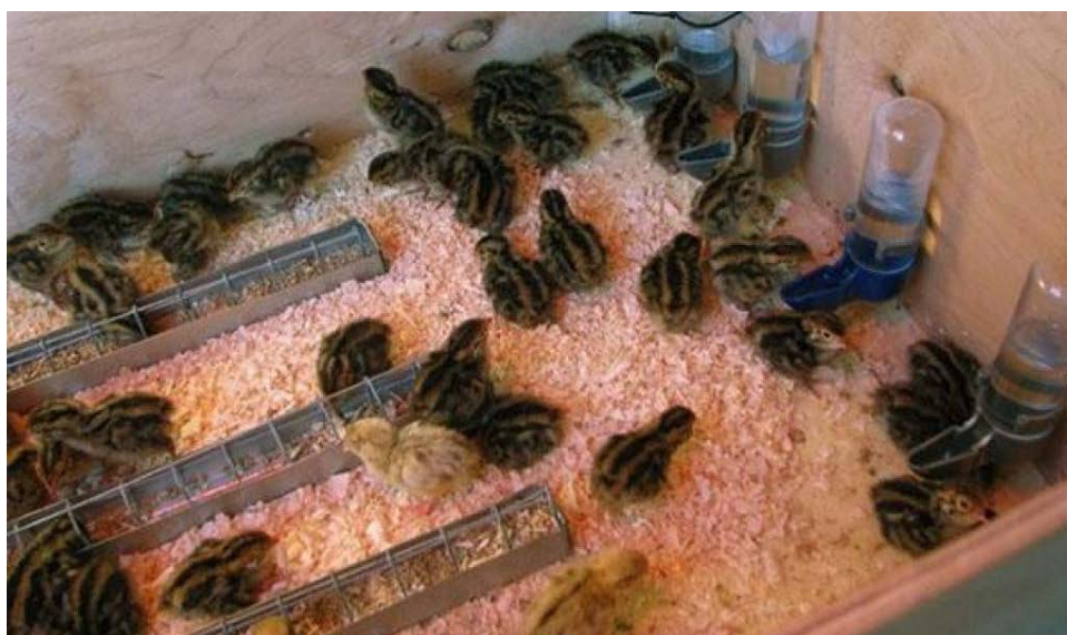
Figure 1: Feeding of quails experimental group

Bioavailable preparation of the essential trace element selenium, developed and synthesized by specialists of the Department of Physics and Technology of Nanostructures and Materials of the North Caucasus Federal University, was used for the research [16].