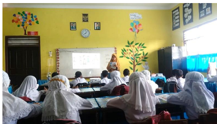
Figure 2: prosody modeling syntax

The second syntax is the prosodic modeling syntax. The teacher distributed story books to the students in the class and asked the students to first listen to how to read the story correctly. After that, the teacher gave an example of just one paragraph to minimize the noise in the class.