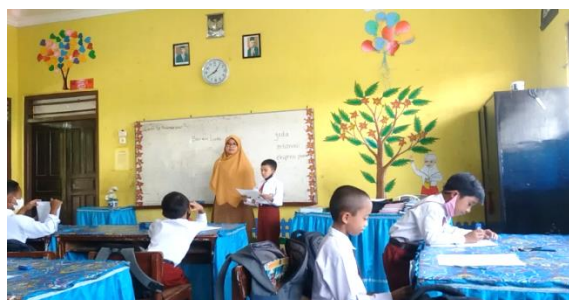
Figure 5: communication syntax

The teacher asked students to close the storybooks on their desks and ask the students to collect the books in front of the class. Afterward, the students take out their writing instruments. The teacher handed out a piece of plain HVS paper to rewrite the story in their language. The teacher asks them to rewrite the story they read in their language for 20 minutes. Students reread the stories they wrote in their language in front of the class.