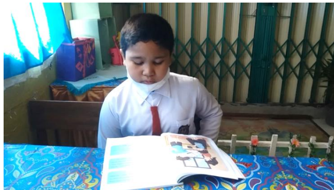
Figure 4: Independent reading syntax

The teacher took five minutes to practice reading fluently independently. Students returned to practice reading fluently independently. The teacher focused the students' attention on the habits created in their school and clapped to encourage the students. Students came to the front of the class according to their wishes and desires without coercion from the teacher. Students tried to read fluently independently by reading the text in front of the class. The teacher also reminded parts of the text that were still being read with inaccurate intonation.