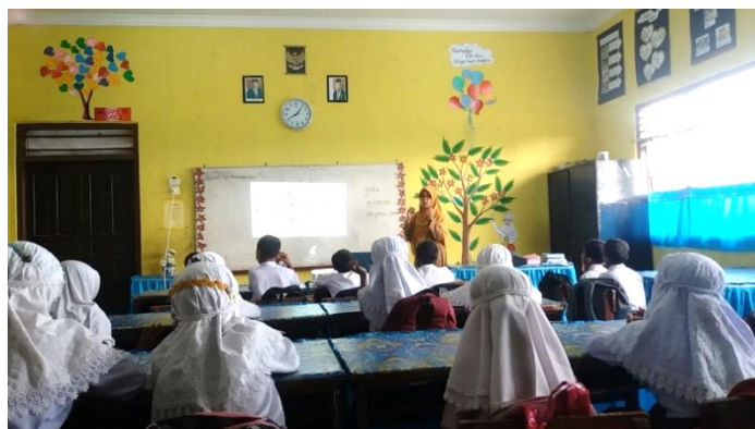
Figure 1: guessing syntax

the teacher conducted a question-and-answer session about fluent reading. The teacher explored students' schemas about pauses, intonation, and voice expressions. The teacher explained about pause is the process of stopping reading by paying attention to the punctuation marks in the reading text. The process of explaining the understanding of prosodic elements was accompanied by a question-and-answer process with students about their experiences of reading and listening to students' stories.