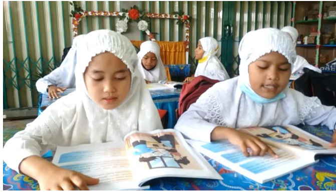
Figure 3: decoding and prosody tutor syntax