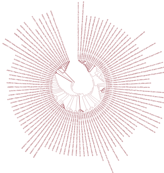
Figure 2: Distribution of homogeneous and heterogeneous clusters of rabies virus glycoprotein (envelope) gene sequences. Bold lines indicate homogeneous clusters from different regions, thin lines indicate heterogeneous ones.

An increase in the number of pets, their untimely vaccination or refusal to vaccinate them, the poorly controlled number of homeless animals in cities, and the insufficient work of the veterinary service led to the fact that the urban type of rabies began to dominate over the natural