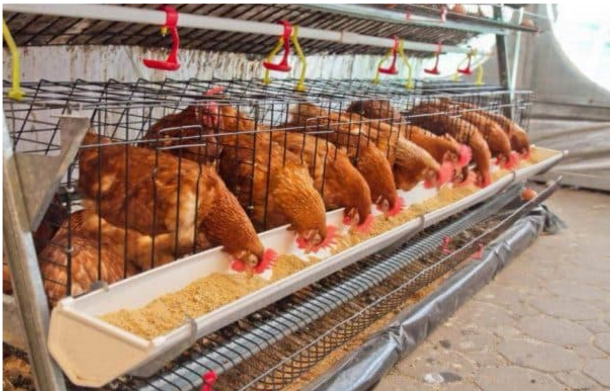
Figure 1: Chickens of the Brown Nick cross used in the experiment

The tests were carried out on the livestock of the Brown Nick cross, from 442 days of life to 472 days of life in industrial poultry farming (Fig. 1). The duration of the experiment was 28 days (from 08/17/2022 to 09/13/2022). The feeding experiment was carried out according to the VNITIP recommendations (Fisinin et al, 2000, Egorov et al., 2019).