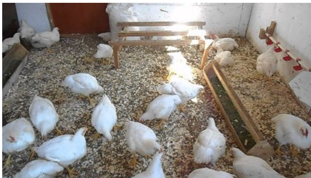
Figure 1: Experimental group of broiler chickens of the cross "Ross-308"

To conduct the experiment, control and experimental groups of broiler chickens of the Ross-308 cross were formed (Figure 1).