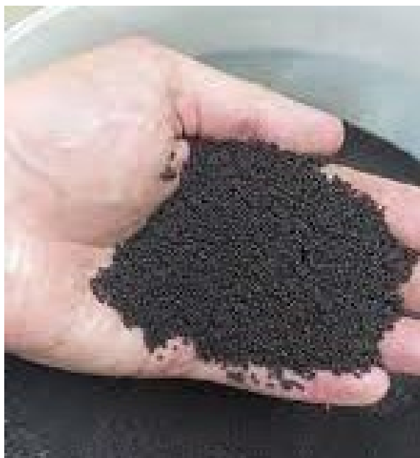
Figure 2: Supplementary nutrition complex "Blackfeed Plus®"

The absolute increase in the live weight of broiler chickens was taken into account weekly. The safety of broiler chickens - by accounting for the fallen young and counting the number of heads. Feed consumption per 1 head for growing periods was determined by weighing the feed given. The supplementary nutrition complex "Blackfeed Plus®" was introduced into the mixed fodder by the method of stepwise mixing.