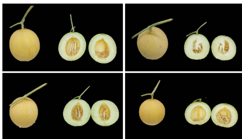
Figure 4: Mature fruit of Galia melon and fruit cut open showing flesh color harvested from tissue culture seedlings of different ages: fruit from 14-day-old seedling (control) (A), fruit from 10-day-old tissue culture seedling (B), fruit from 15-day-old tissue culture seedling (C), and fruit from 20-day-old tissue culture seedling (D)

Comparing the tissue culture seedlings at different ages at the time of transplant of both cultivars with the control plants, there were no statistically significant differences in TSS or pH. Fruits of the Galia cultivar had TSS ranging from 13.13 \pm 0.05 to 14.50 \pm 0.24^\circ Brix and fruits of the Orange Man cultivar had TSS ranging from 8.17 \pm 0.14 to 9.90 \pm 0.40^\circ Brix, and fruits of both cultivars all had pH of close to 6. We can conclude that the age of the seedling at the time of transplant has no significant effect on the sweetness or pH of both these cultivars. The level of sweetness depends on the dominant genes of each cultivar (Akrami and Arzani, 2019). A previous report noted that Galia melons from Japan had TSS of 12\text{-}13^\circ Brix (Schultheis et al., 2002). In the present study, there were statistically significant differences in titratable acidity, however. In both cultivars, melons from seedlings that were 20 days old at the time of transplant had the lowest titratable acidity. Sweetness and acidity are both characteristics that are very important to consumers. Most consumers expressed the greatest satisfaction with melon cultivars that are sweet and fragrant (Apiratikorn et al., 2019). In general, melon flesh that has a TSS of at least 9^\circ Brix is acceptable to consumers (Burger et al., 2006).