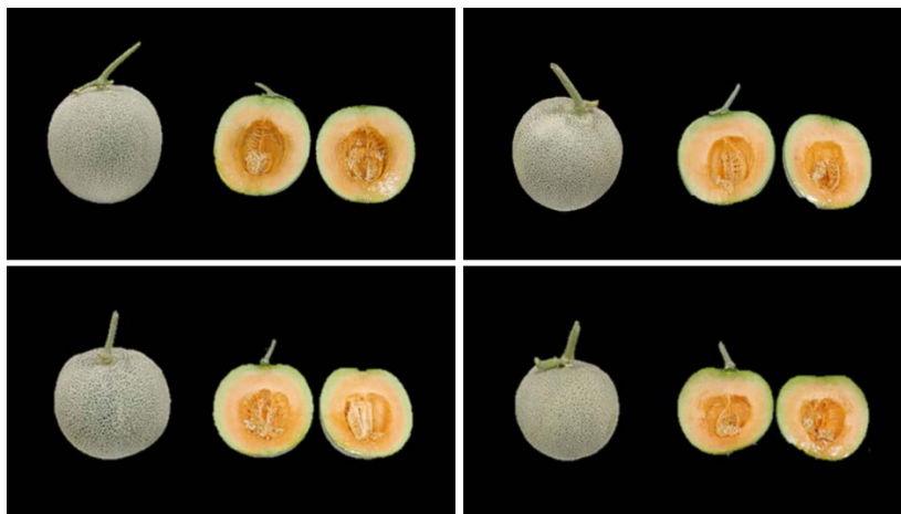
Figure 5: Mature fruit of Orange Man melon and fruit cut open showing flesh color harvested from tissue culture seedlings of different ages: fruit from 14-day-old seedling (control) (A), fruit from 10-day-old tissue culture seedling (B), fruit from 15-day-old tissue culture seedling (C), and fruit from 20-day-old tissue culture seedling (D)