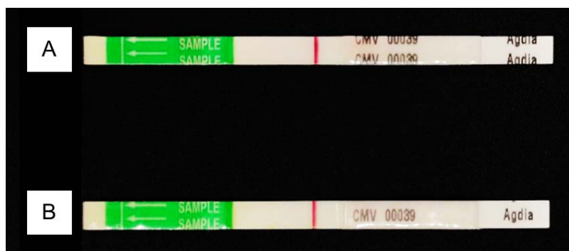
Figure 2: Result of pathogen detection by the Cucumber Mosaic Virus (CMV) ImmunoStrip® test: Galia melon (A) and Orange Man melon (B).

After the melon seeds had sprouted and grown true leaves, leaf tip samples were taken to test for Cucumber Mosaic Virus using the CMV ImmunoStrip® test, which is based on serology principles and uses antiserum linkage, or IgG bonding of the virus to colloidal gold particles, a reaction which is easily visualized by a change to reddish-orange color on the test strip. If the sample tested is virus-free, there will be only one reddish-orange band on the test strip, and if the